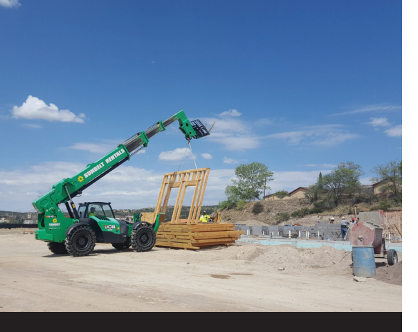
Apartment construction began in April 2018 and took approximately 20 months to complete.

Working with EPA on the Hillcrest Hospital project is one of the best experiences I've ever had as a public servant.