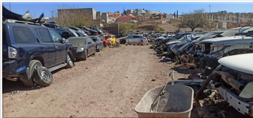
Junk vehicle site in Nogales, Sonora.

The government of Baja California is making efforts to minimize the adverse effects of the management of scrap tires generated in Baja California. The federal government, through the Secretary of Economy, authorizes the importation of 800,000 used tires from the United States to Baja California each year. In 2020, due to the effect of the COVID-19 pandemic, it was not possible to import the entire quota, however, the proliferation of tires that are not handled properly continues to be visible. It is estimated that for every tire imported legally, another may be imported informally or illegally. In recent years, only two companies have been authorized to handle tires properly, Cemex in Ensenada and Geocycle in Mexicali. The greatest uncertainty lies in the lack of financing for tire handling and processing infrastructure.