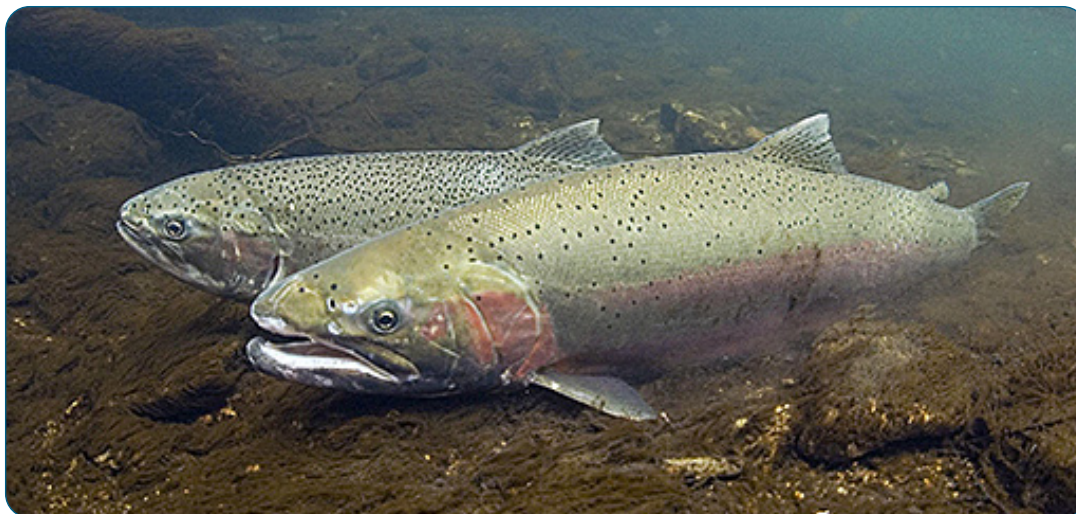
Steelhead trout -- US Fish and Wildlife Service

☎ TTY users please call the Federal Relay Service at 800-877-8339 and ask for Andrea.