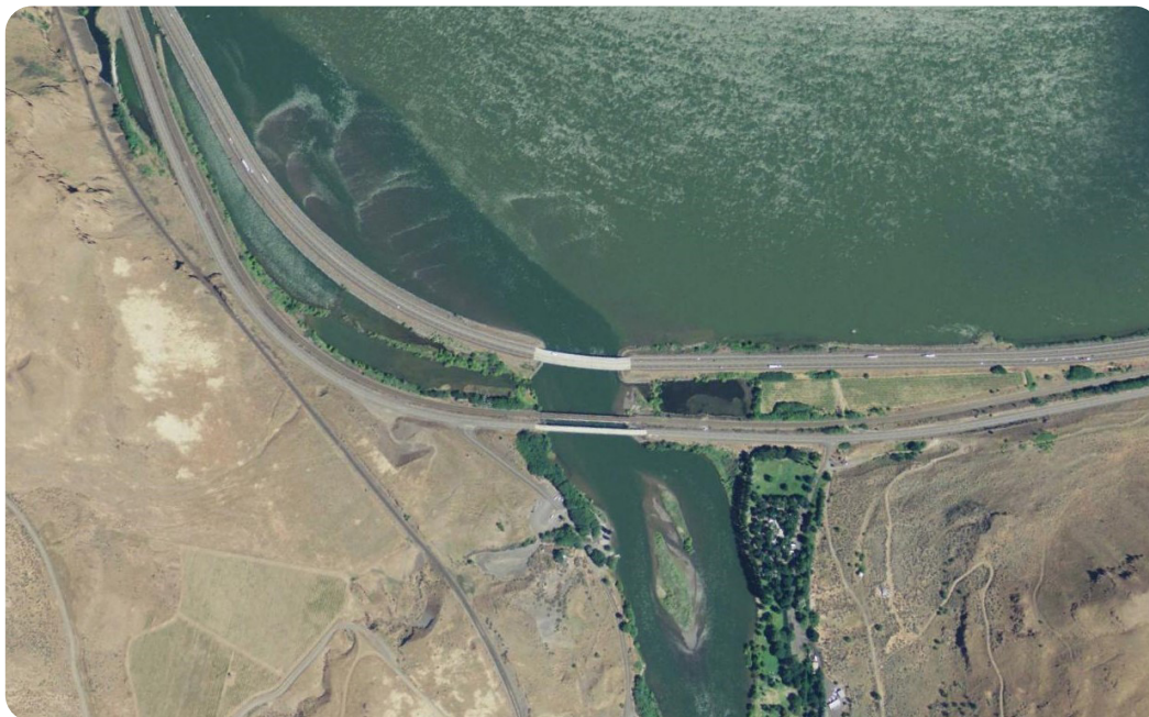
Aerial view of Deschutes River confluence with Columbia River