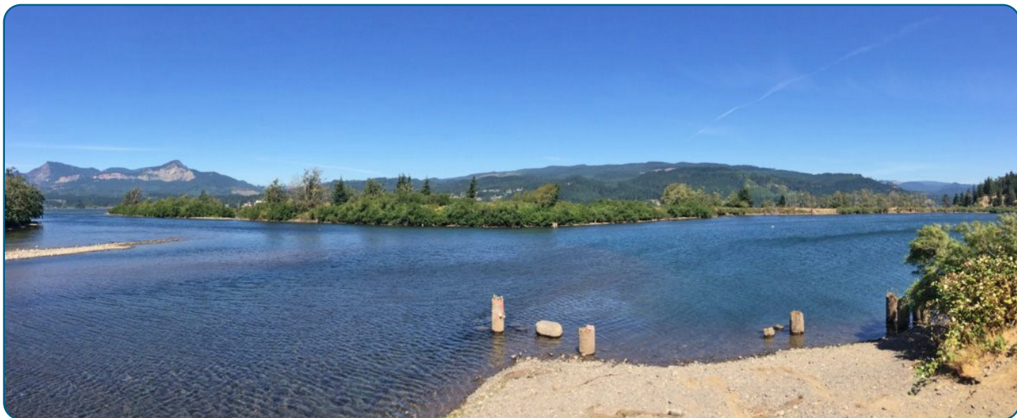
Herman Creek: One of twelve primary cold water refuges

The plan includes assessments, or “snapshots,” of 12 primary refuge tributary watersheds. The snapshots discuss watershed features and temperature trends, opportunities to cool the tributaries, current restoration efforts, and actions to protect and restore refuges. The plan includes similar snapshots for two watersheds with the potential to provide additional refuge in the Lower Columbia River, if restored: the Umatilla River and Fifteenmile Creek.