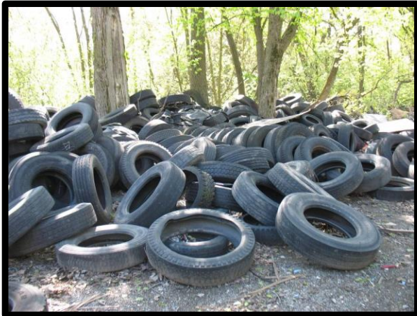
Figure 1: Abandoned scrap tire pile

Abandoned tires (often found in abandoned scrap tire piles) have been discarded and do not remain within the control of the generator, and thus do not meet the criteria set forth in 40 CFR section 241.3(b)(1). They are not being managed as a valuable commodity and are solid waste. Even though abandoned tires could be beneficially reused whole as fuel, the statutory definition of solid waste under the Resource Conservation and Recovery Act (RCRA) does not allow this. A discarded tire does not lose its status as a waste solely because it is burned for energy recovery (76 FR 15476).