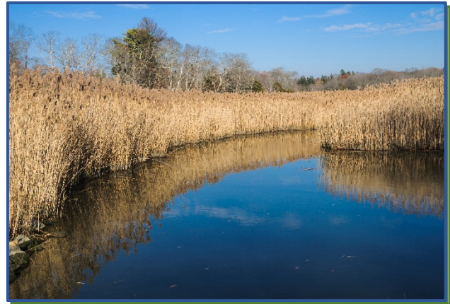
Monocultural stand of Phragmites australis along the Duck River in Old Lyme, CT

In a study on six tidally restricted marshes in Connecticut, Roman et al. (1984) found that Phragmites became the dominant species over most of the high and low marsh, except in thin bands along creeks and in cases where restriction was non-continuous (two sites had seasonally managed tide gates). When a tidal restoration project at one of the marshes replaced an old tide gate with a new self-regulating one, allowing for tidal exchange on incoming (flood) tides and free flow of water away from the marsh during outgoing (ebb) tides, a significant reduction in Phragmites height was observed within one growing season. Another restoration effort removed dikes and tide gates completely, allowing full tidal flushing. After one year of reintroduced flow, Phragmites vigor decreased with a reduction in heights from 2-3m to 1m or less, and its density declined by at least 50%.