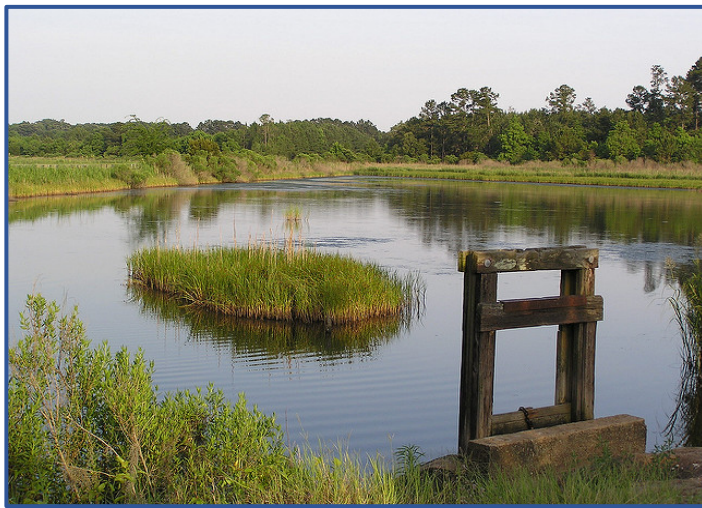
Historic rice impoundment, Beaufort County, SC (Henry De Saussure Copeland)

material. In instances where tidal restriction causes wetland drainage, this beneficial process is actually reversed by exposing the accumulated organic layer to oxygen, promoting its breakdown to carbon dioxide by aerobic microbial respiration, and ultimately its return to the atmosphere. Tidal restriction also lowers salinity, which can lead to greater emissions of methane, another greenhouse gas, since fresher water does not have the abundant sulfate ions found in more saline environments that limit methane production and release to the atmosphere.