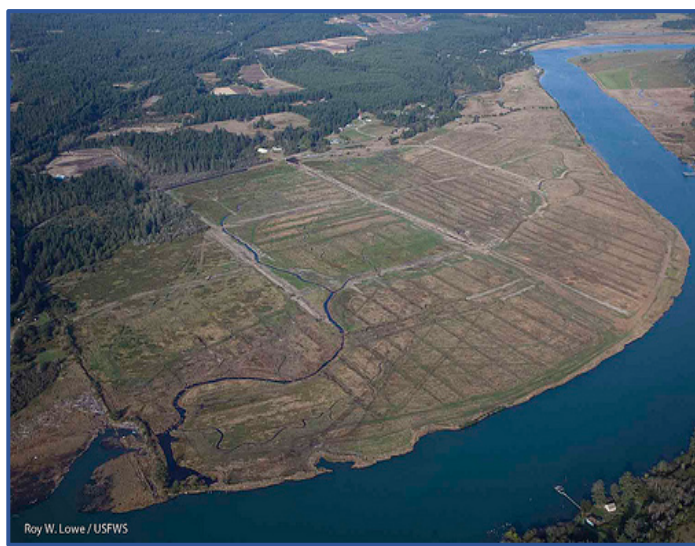
Ni-lestun Tidal Marsh Restoration along the Coquille River in Bandon National Wildlife Refuge (OR). This project was partially funded by the New Carissa oil spill settlement mandated under the Oil Protection Act

The removal of tidal restrictions could be funded as a way of restoring habitat lost or degraded through environmental contamination. For example, in Massachusetts, the Buzzard’s Bay Tidal Restriction Atlas (2002) was used during the NRDA process for both the Buzzards Bay oil spill (2003) and the New Bedford Harbor cleanup to identify potential salt marsh restoration sites and award settlement funding (Joe Costa, personal communication, February 15, 2018). Under the oil spill NRDA, the removal of two tidal restrictions were identified for funding: a non-functioning culvert and an old dam (Buzzards Bay Trustees, 2017). Under the New Bedford NRDA, at least one tidal restriction has been removed as part of a salt marsh restoration project