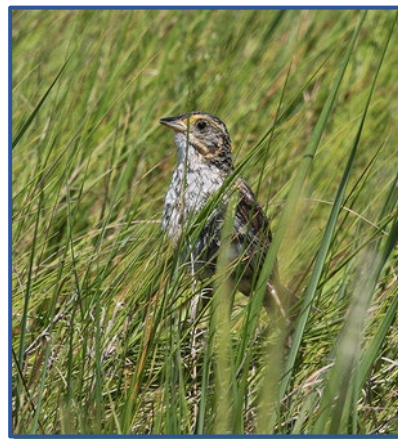
Saltmarsh Sparrow (Aaron Maizlish)

Certain bird species, especially in the Eastern U.S., are highly dependent on Spartina dominated salt marsh for breeding, including Ammodramus maritimus (seaside sparrow), Ammodramus caudacutus (saltmarsh sparrow), Ammodramus nelsonii subvirgatus (nelson's sharp-tailed sparrow), Tringa semipalmata (eastern willet) and Rallus crepitans (clapper rail). Warren et al. (2002) showed that with the recovery of salt marsh vegetation after the restoration of tidal flow, formerly restricted sites dominated by Phragmites were eventually recolonized by species associated with healthy salt marsh. They found that during the early stages of restoration (4-5 years), the habitat was still unsuitable for marsh specialists, but by 15 years post-restoration, the use of the marsh by A. maritimus and A. caudacutus was equivalent with the reference wetland. In the case of A. caudacutus , it is important to note that tidal restoration alone is not necessarily enough to provide breeding habitat. Elphick et al. (2015) found that this species was less common where tidal flow had been restored than at reference sites and nested in only one of 14 flow restoration plots. A. caudacutus is dependent specifically on high marsh habitats for breeding, and many tidal restoration projects are at an elevation where low marsh is most affected by restoration practices.