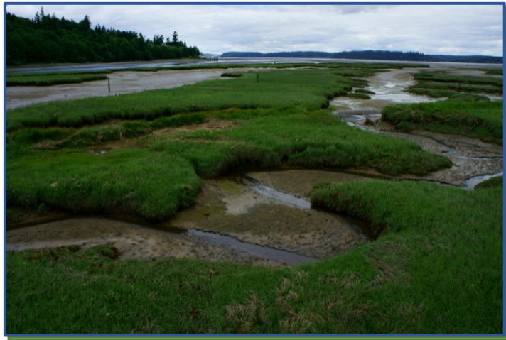
Tidal Marsh at Low Tide, Billy Frank Jr. Nisqually National Wildlife Refuge, WA

The coastal ecosystem is comprised of a wide array of tidally influenced habitats such as mud flats, barrier beaches, and wetlands of varying vegetative compositions. Tidally influenced wetlands can take a number of forms, including salt-, brackish-, and freshwater marshes as well as mangroves and other types of shrub or forest swamps. Tidal wetlands are an important component of the coastal ecosystem, providing nursery and spawning habitat for commercially and recreationally important fish and shellfish species; breeding and foraging habitat for migratory waterbird species; water quality benefits including filtration of water and uptake of nutrients and pollutants; and critical buffer from coastal flooding associated with storm surges and other adverse weather events. Tidal wetland habitats have been, and continue to be, impaired or lost due to a variety of human activities, including conversion to agriculture and urban land uses, introduction of non-native species, metal and nutrient pollution, and alteration of coastal hydrology (Gedan et al., 2009). Sea level rise is also an important contributor to the loss of tidal wetlands. For example, between 2004 and 2009 in the conterminous U.S., over 124,000 acres of salt marsh were lost, mainly due to sea level rise and associated erosional effects (Dahl and Stedman, 2013).