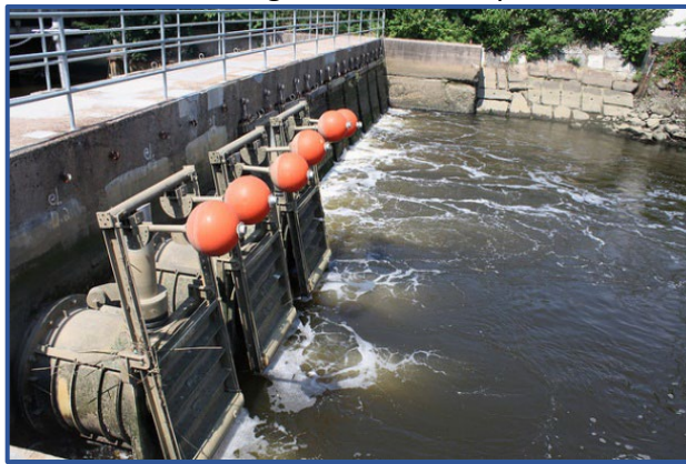
West River SRTs in New Haven, CT

Ecological Effects of Tide Gate Upgrade or Removal: A Literature Review and Knowledge Synthesis , recently completed by Souder et al. (2018) for the Oregon Watershed Enhancement Board (OWEB) is a resource for entities planning tide gate retrofit or removal projects. This document outlines the state of knowledge of the effects to aquatic organisms (largely salmonids) and estuarine environments of removing or replacing traditional tide gates with