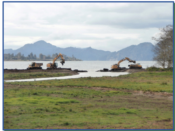
The USACE Portland District breaches the Steamboat Slough levee along the Columbia River to restore tidal wetlands that will provide habitat for young salmon

NOAA’s National Marine Fisheries Service (NMFS) also has the authority under the ESA to regulate certain migratory fish species in coastal waters. See 16 U.S.C. § 1536; see also 16 U.S.C. §§ 1361 through 1423h. In Oregon, a Programmatic Biological Opinion (PBO) issued by NMFS (2018a) for endangered species populations of Chinook and coho salmon , among others, will assist in the authorization, funding, and implementation of tidal area restoration projects (referred to collectively as the Tidal Area Restoration Program, or TARP). This PBO permits activities in twelve categories that are proposed to be authorized, funded, or implemented by the USACE, FEMA, and FHWA. These activities include tide gate removal, replacement, or retrofit, set-back or removal of dikes and levees, and dam and legacy structure removal. The PBO includes conservation measures and other action requirements that must be met for an action to qualify for inclusion.