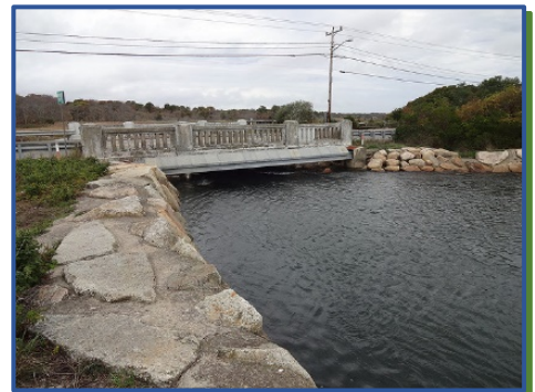
Top Left: Series of levees in south San Francisco Bay (Andrei Stanescu/iStock); Top Right: Mosquito Ditches at Assateague Island National Seashore (National Park Service); Bottom Left: Round Hill culvert in Dartmouth, MA (Lia McLaughlin/USFWS); Bottom Right: Undersized bridge on Parkers River in Barnstable, MA (Lia McLaughlin/USFWS)

Tidal restrictions can also arise from sediment, debris, or vegetation blockages caused by these structures or surrounding land uses. However, most tidal restrictions were put in place specifically to alter site hydrology for agriculture, development, mosquito control, flood control, and other human uses. Numerous transportation structures (culverts and bridges) can also restrict tidal exchange because they are not sized to support full hydrologic function. These structures can inhibit tidal exchange through their size (span length and rise) and/or their elevation. Many times, a structure exhibits both problems, though they can occur separately. For example, a culvert may be properly sized, but is set too high so that flow in (filling) and out (drainage) are still restricted. Given the prevalence of tidal restrictions related to transportation infrastructure, it will be a primary focus in this discussion, though other types of tidal restrictions will also be addressed as appropriate.