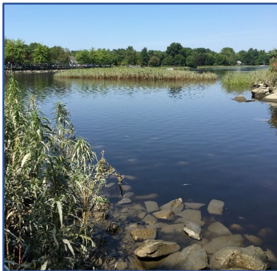
Top: Exeter River during removal of the Great Dam in Exeter, NH; Bottom: The Exeter River joins the tidal Squamscott River just downstream of the Great Dam removal project