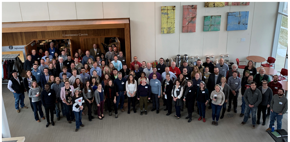
Some of the attendees at February 4-6, 2020, Great Plains and Midwest Harmful Algal Bloom Conference at the University of Kansas Edwards Campus in Overland Park, Kansas.

In 2020, we once again prioritized work on commonsense nutrient management solutions aimed at improving water quality. partnered with the Office of Research and Development, Region 5, Region 8 and the Office of Water to host the multi-regional Great Plains and Midwest Harmful Algal Bloom Conference on February 4 - 6, 2020 at the University of Kansas Edwards Campus in Overland Park, Kansas. The workshop brought together over 170 participants from 17 states, 2 tribes, agricultural partners from the Great Plains and Midwest, as well as experts on HABs prevention, mitigation and control, such as the University of Kansas Designated Research Center Kansas Biological Survey. is finalizing a proceedings document summarizing the successes, challenges, and short and long-term opportunities identified by workshop participants.