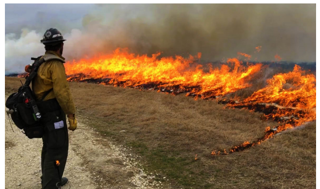
A crew member monitors a Flint Hills Kansas prescribed burn.

The 2010 Flint Hills Smoke Management Plan and our work together since then demonstrate that prescribed fires can be managed in a way to reduce air quality impacts and avoid potential regulatory implications. This helps us to achieve our goal of protecting public health and preserving the tall grass ecosystem – while also supporting the agriculture economy.