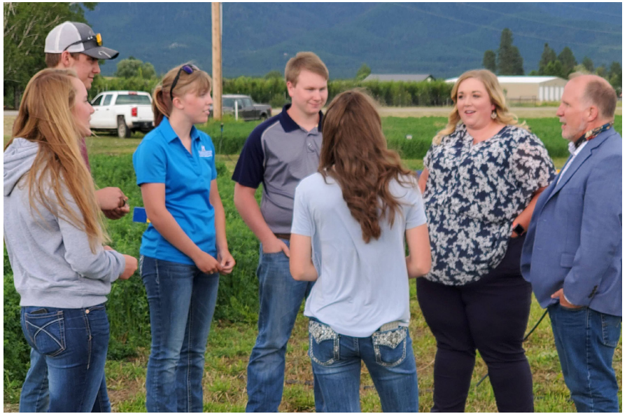
Region 8 EPA Staff talk with local FFA students in Montana in summer of 2020.

America: In January 2020, FFA students from around Colorado learned about natural resource careers with the federal government from EPA, USDA Natural Resource Conservation Service, and the Bureau of Reclamation. EPA presented a mock emergency clean-up exercise where students saw firsthand the various job types involved in a clean-up including; risk communications, response and investigation. In February 2020, Region 8 staff served as judges in Wyoming FFA Agri-science Fair. EPA staff judged projects in the following categories: Environmental Service/Natural Resource Systems, Food Products and Processing Systems, Plant Systems, and Social Science.