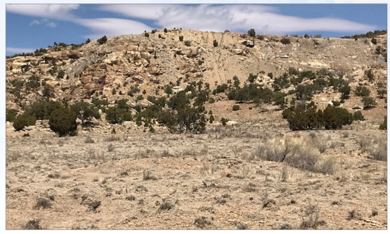
Claim 28 is an abandoned uranium mine in the Tachee-Blue Gap Chapter where the Phase 1 Trustee conducted an investigation. Additionally, the Phase 2 Settlement provides funds to conduct a water study and clean up the mine.

Funds are available to begin the cleanup process at 21 mines, approximately 75% of the mines in the Central AUM Region, including two priority mines and one water study. USEPA continues to look for companies responsible for the remaining mines in this region.