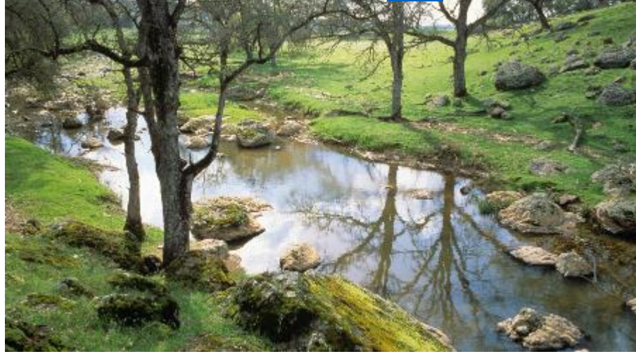
The Cosumnes River