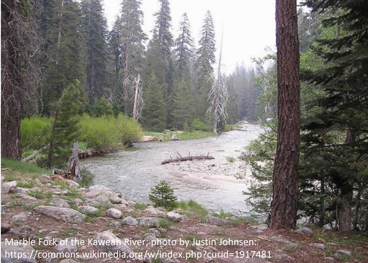
Marble Fork of the Kaweah River