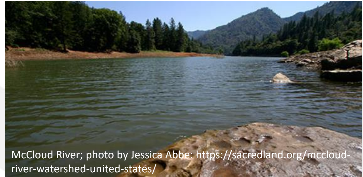
McCloud River; photo by Jessica Abbe: https://sacredland.org/mccloud-river-watershed-united-states/