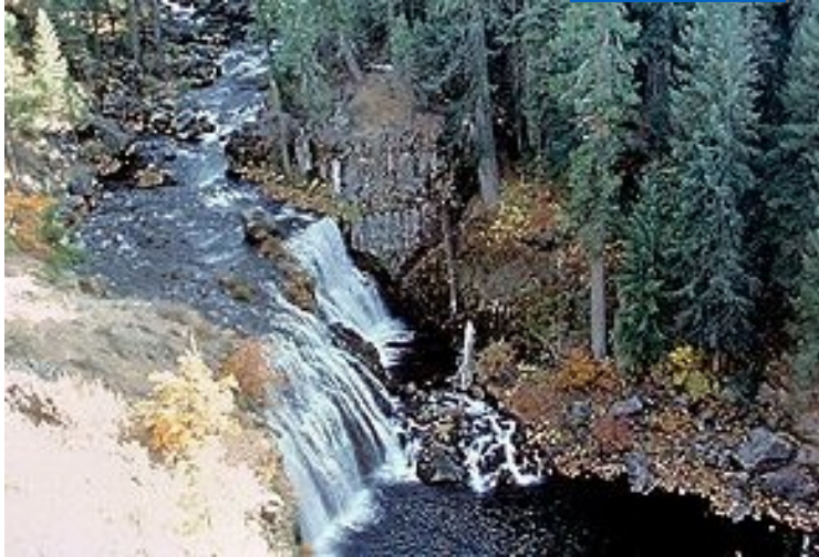
The McCloud River