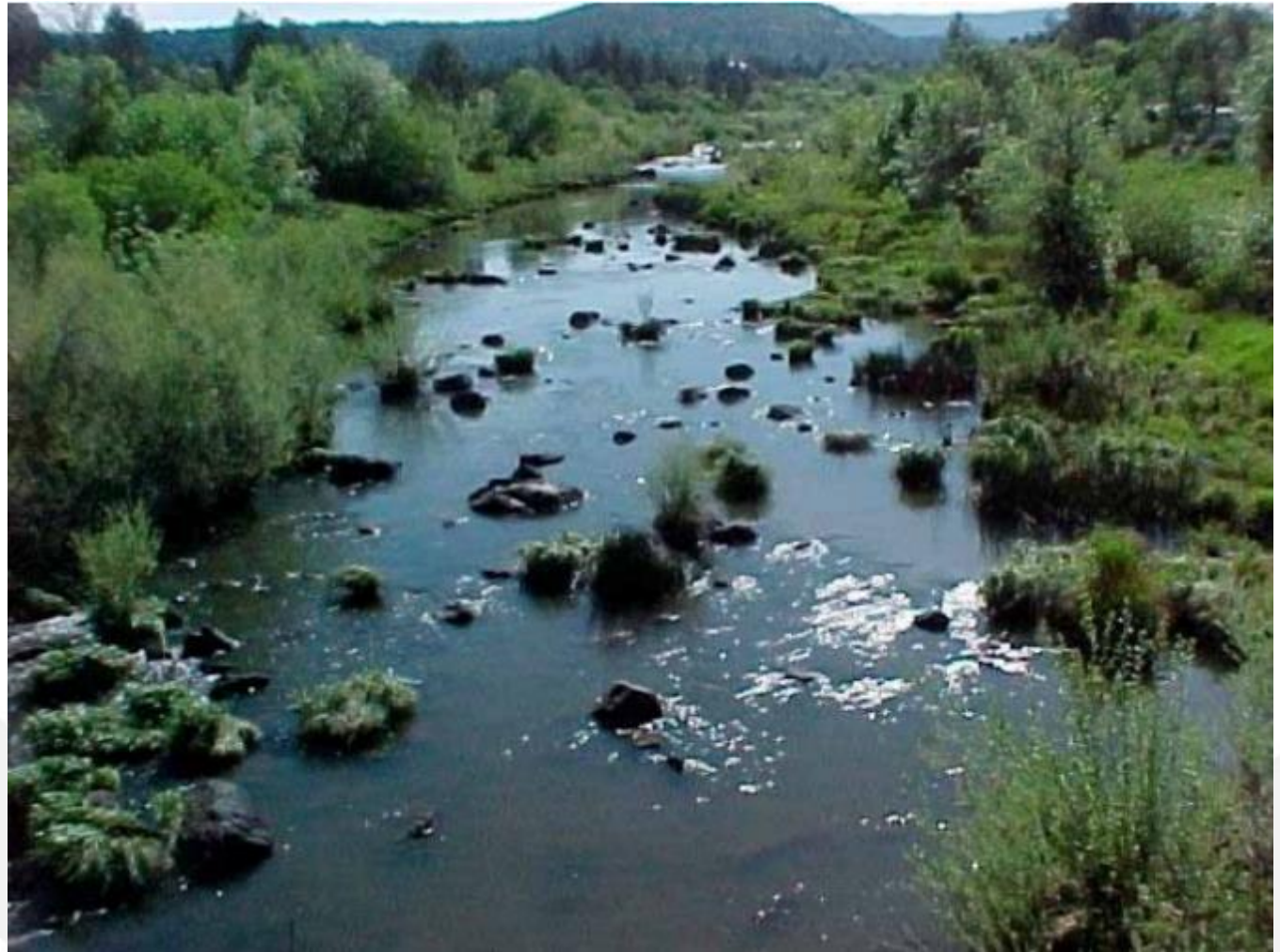
This photo is taken from the front of the Pit River Water Quality Study (2001-2002)