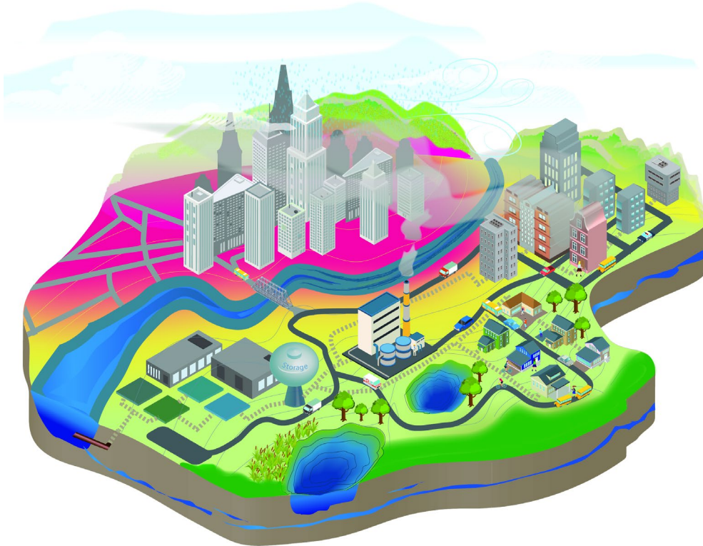
Figure 1: Schematic Overview of a Wide-Area and Water-System Contamination Incident for Scenario-Based Resilience Planning

A disaster that results in wide-spread chemical, biological, radiological, and nuclear (CBRN) contamination over a large outdoor area, or throughout a water and wastewater system, presents a daunting challenge to EPA, state, tribal and local responders in carrying out their responsibilities. Once released into the environment, contaminants can spread via natural forces and human activities. The potential for cross-media spread of contamination is depicted in Figure 1 and represents a sample of the complex scenario that large-scale contamination incidents present to communities.