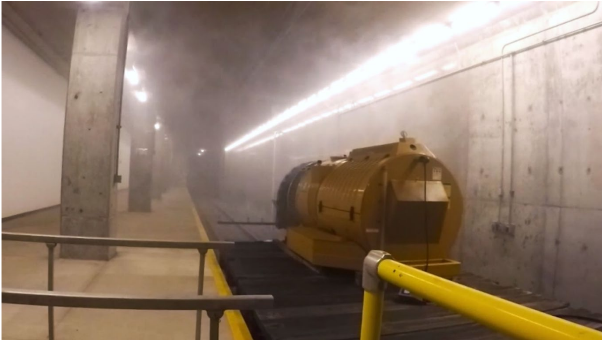
Figure 3: Demonstration of the use of an orchard air blast sprayer for the decontamination of a subway station during an operational technology demonstration