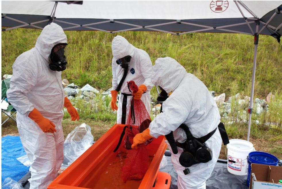
Figure 6: Testing of on-site solid waste treatment approaches.