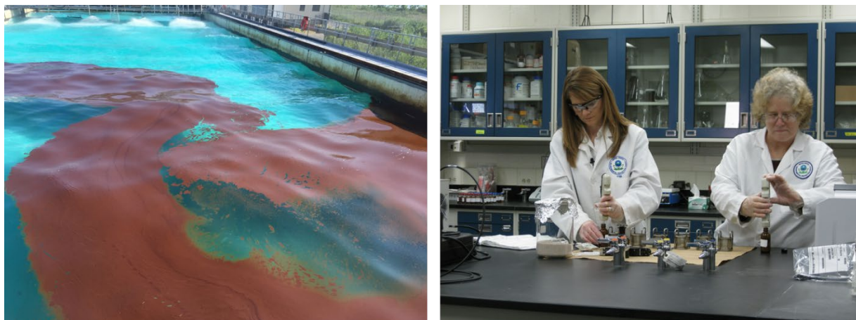
Figure 5: Photo of spill simulations using the Ohmsett wave tank facility at the Naval Weapons Station Earle in New Jersey (left panel) and laboratory evaluation of the performance of spill-treating agents (right panel).

ORD oil spill research includes experiments over large scales, such as spill simulations using wave tank facilities, like Ohmsett at the Naval Weapons Station Earle in New Jersey (Figure 5, left panel), and at small scales for evaluating the performance of spill-treating agents on the NCP Product Schedule (Figure 5, right panel).