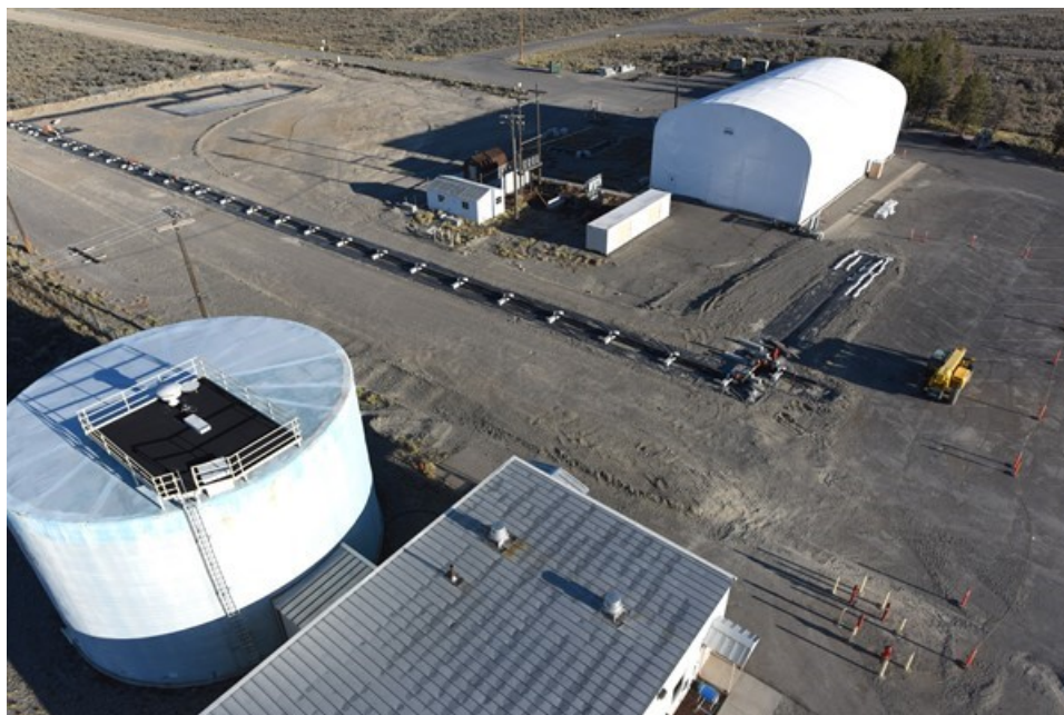
Figure 4: Aerial view of the Water Security Test Bed

Initial HSRP research efforts have focused on developing prototype decision-support tools for drinking water systems. HSRP will focus on expanding these tools to "all hazards", validating their results with real-world data, and using the tools in case study applications with partner drinking water utilities.