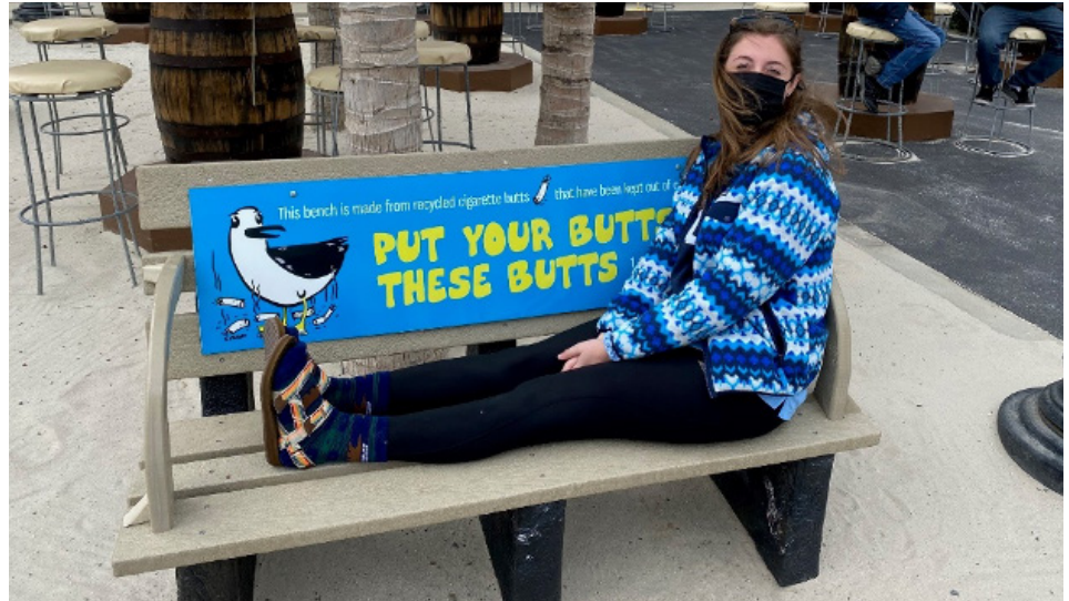
"Put Your Butts on These Butts" bench in Ocean City, MD.

More than 400,000 cigarette butts have been recycled through the Cigarette Litter Prevention "butt hut" program. Cigarette butts are shipped to TerraCycle to be repurposed into benches. In July 2020, four benches made from recycled cigarette butts were delivered and installed in Ocean City to help create public awareness around proper disposal. Benches feature the slogan "Put your butts on these butts" and have been installed on the boardwalk