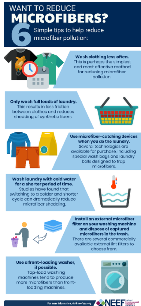
Infographic with tips on reducing microfiber pollution from the TFW article "What You Should Know About Microfiber Pollution."

Check out the Trash Free Waters Webinar Library for access to any webinars you may have missed over the past few months. In November, we hosted a webinar on "Experiences and Lessons Learned from Trash Capture Projects;" three expert speakers shared their knowledge and insight on trash capture planning, siting, installation, and maintenance. On March 11 we hosted the fifth webinar in the TFW series, "Reuse Models as Part of the Solution to the Plastic Pollution Crisis." This webinar explores three very different types of reuse and refill models, explaining how they work and the stories behind them.