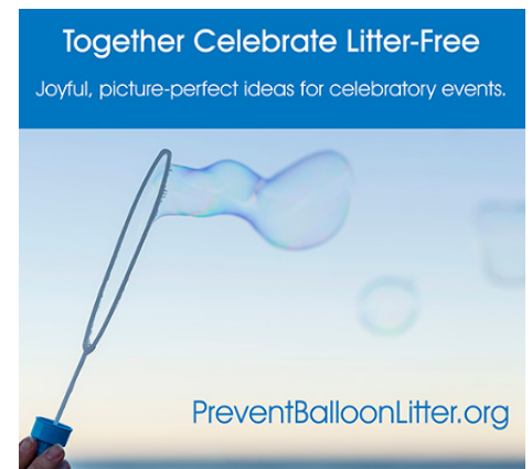
Blowing bubbles as an alternative to releasing balloons.

The “Prevent Balloon Litter” website offers inspirational litter-free ideas to commemorate important life events. Fun ideas include blowing bubbles, making paper airplanes or pinwheels, handing out native seeds to plant, creating a large banner, dedicating a bird bath or bench, and more. The website also offers resources such as educational activities, video content, and research publications on the issue. A short animated video , recently released by the Virginia Coastal Zone Management Program and Clean Virginia Waterways of Longwood University, is included on the website. To explore more of the campaign and sign the