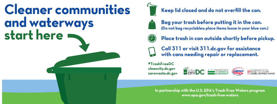
Curbside Disposal Education Pilot bin sticker.

D.C. staff conducted 11 weeks of baseline observational litter surveying and an additional 11 weeks of post-implementation surveying along representative routes in each pilot neighborhood (with some streets and alleyways included in a control group). Focus group discussions with D.C. residents and neighborhood leaders will be held over the coming weeks for further citizen insight on perception of litter in the community and effectiveness of the campaign. TFW anticipates compiling a short report summarizing data findings and recommendations/lessons learned for other communities that may be interested in adopting a similar campaign in the future. If the project proves to be successful, D.C. has expressed interest in expanding the campaign throughout the city.