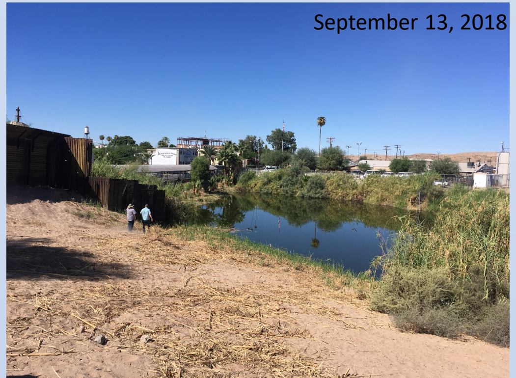
Andrade Site Visit – View of fence (0.9 mi) between Colorado River (east) and the canal (west) with view of Algodones border crossing and parking lot across the canal. (w/ Reps. From Quechan and Cocopah Tribes)