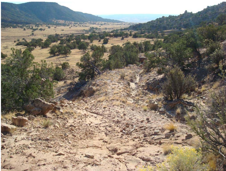
Photo 2. Section 34 Mine site, towards the south. Washed out access road.