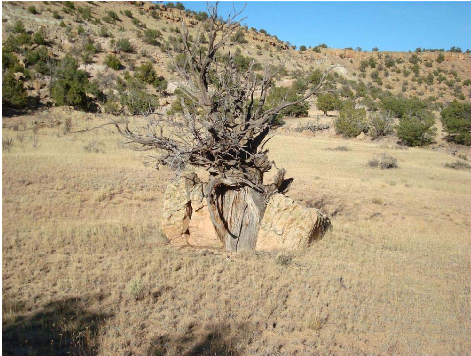
Photo 1. Section 34 Mine site along hillside, towards the northwest