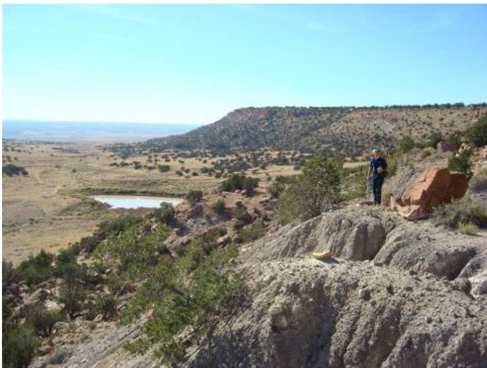
Photo 2. Lost Mine site, towards the south, livestock watering hole in background