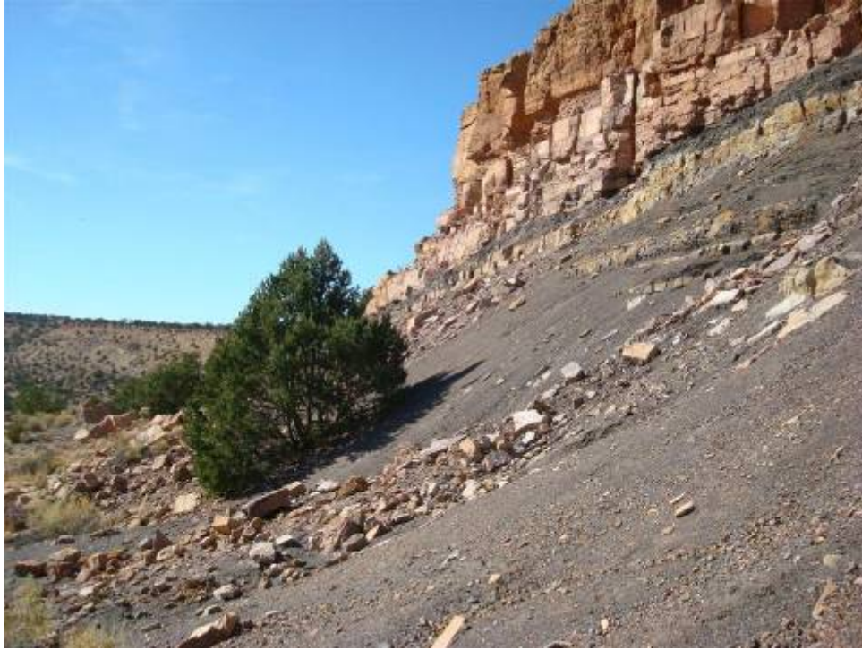
Photo 3. Lost Mine site, alluvium from bluff