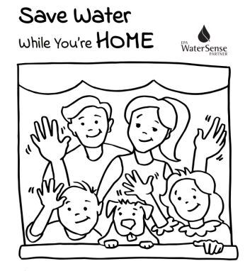
A Water Conservation Coloring Book ww.epa.gov/watersense for more kids acti

Water is such a precious resource that we all need to do our part to save it. Kids can learn simple tips to start saving water, complete a puzzle game, and become an Earth Day Detective looking for leaks in and around their house at our WaterSense for Kids website: www.epa.gov/ watersense/watersensekids