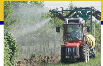
Pesticides and Toxics