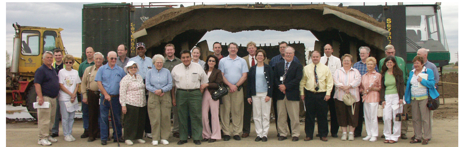
JOAAP Restoration Advisory Board

The former Joliet Army Ammunition Plant (JOAAP)—one of the largest and most productive ordnance complexes ever built—has a new identity as the Midwin National Tallgrass Prairie, Abraham Lincoln National Cemetery, Prairie View Landfill, and several state-of-the-art manufacturing and distribution business parks. After extensive environmental investigation and cleanup, and close collaboration between federal, state, and local governments, community groups, and the private sector, the cleanup of JOAAP was completed in early 2008 – three years ahead of schedule.