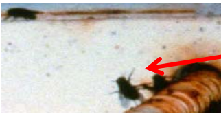
Flies inside an elevated tank

Example – the house fly: Houseflies have been demonstrated to carry Cryptosporidium , Giardia Lamblia , typhoid, cholera, E. coli O157:H7, polio and other pathogens.