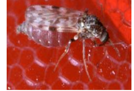
Noreeums (biting midges): 0.059 inch

Insects are capable of fitting through areas that are smaller than they are, and #24 mesh protects against this also.