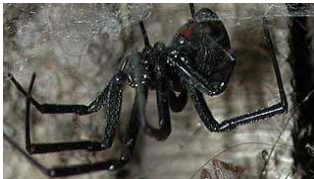
Black Widow: 0.5518 inches