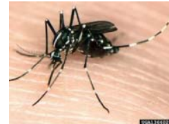
Asian tiger, world's smallest mosquito: 0.078 inch