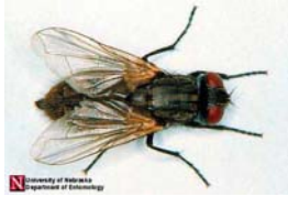
House fly: 0.315 inches