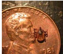
Deer tick: 0.166 inch