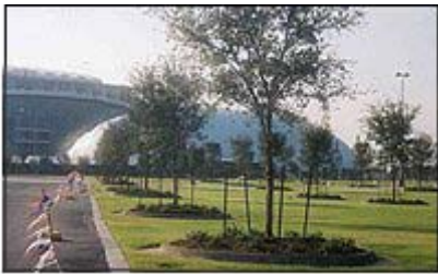
Fans at Houston's Reliant Stadium can park their cars on a porous, grass paving structure.

State-maintained roads in Harris County, where Houston is located, total approximately 3,868 miles. Of these, approximately 1,962 have portland cement concrete (PCC) as their surface material. Asphalt concrete covers the remaining 1,906 miles. Throughout the City of Houston, PCC has typically been used for new construction of arterials, other types of major thoroughfares, on secondary streets, and in subdivisions.