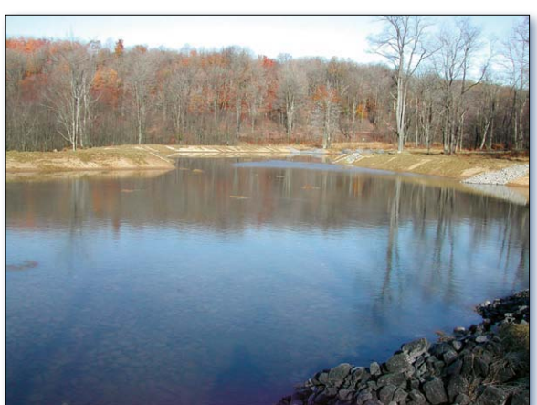
Figure 2. Another limestone treatment pond.