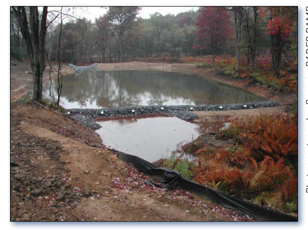
Figure 1. One of a series of limestone treatment ponds installed.

Between 2001 and 2005, project partners installed several passive treatment systems in the Gumboot Run watershed. First, in 2001, PADEP's Knox District Mining Office installed a vertical flow system to add alkalinity directly into the stream. Then, in 2007, partners installed an additional passive treatment system to more thoroughly treat AMD sources in the watershed at a cost of approximately one million dollars. This project, designed by PADEP's Bureau of Abandoned Mine Reclamation (BAMR) and completed by E.M. Brown Construction, has a series of ponds with limestone beds that neutralize the acidic water and allow metals to drop out of solution (Figures 1 and 2).