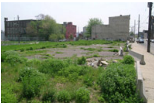
Before: Lot at 2300 North 3rd Street Green Lot, Philadelphia, PA.