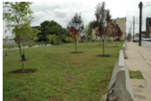
After: Lot at 2300 North 3rd Street Green Lot, Philadelphia, PA.