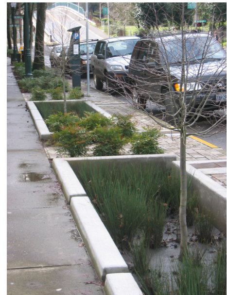
Portland Streetside Infiltration Planters.

Burnsville, Minnesota solved a similar problem of managing road runoff in a slightly different way. Lacking space in the right-of-way to implement bioretention practices, Burnsville launched a one month long public outreach campaign in an effort to get residents involved in the solution. Eighty-five percent of the residents agreed to participate in the rain garden retrofit project and allow the city to build rain gardens on the edge of their property to treat road runoff. The city obtained an $117,000 grant from the Metropolitan Council and contributed $30,000 of the City’s funds to build the rain gardens. Each rain garden cost $7,500: $500 for plants, $8.00/square foot for construction, and $4.50/square foot for education, design and construction supervision. The City has easements to maintain the rain gardens, which have been successful at reducing runoff by 90%. 29