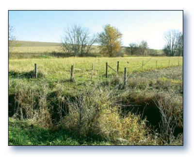
Figure 3. A landowner planted 100-foot filter strips on each side of Deer Creek and installed fencing to keep cows out of the creek during the fall-to-spring stalk grazing season.

planted 94 acres of grassed waterways, added three grade stabilization structures, and installed 134 water and sediment control basins (Figure 2). They also planted 15.275 feet of filter strips (Figure 3), implemented 28 acres of conservation cover (i.e., establishing and maintaining permanent vegetative cover to reduce soil erosion and sedimentation). converted 340 acres to no-till planting, created 18 acres of contour buffers, and built 5,400 feet of fencing for livestock.