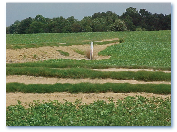
Figure 2. Water and sediment control basins such as this one prevent bank and gully erosion on farmland. The runoff water is temporarily stored behind the berm, eliminating its erosive capabilities further down slope. The ponded water slowly flows out through an inlet riser pipe (center) to an underground tile drainage network.

Creek's exposed and eroded streambanks. The sediment basins also improve downstream water quality and prevent crop damage by slowing down and retaining runoff (Figure 2). One water and sediment control basin includes an underground outlet pipe, which is installed underground and works in conjunction with the basin to drain excess runoff slowly through the soil, preventing erosion during heavy rainstorm events.