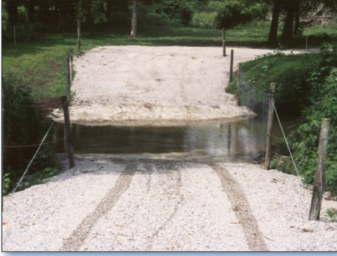
Figure 2. Landowners installed heavy use area protections such as this one which prevents erosion at a stream crossing.