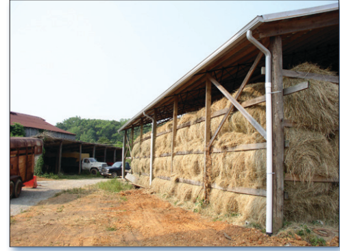
Figure 4. A landowner installed this roof runoff structure (gutters and piping) to prevent stormwater from running across the bare earth of the work area.