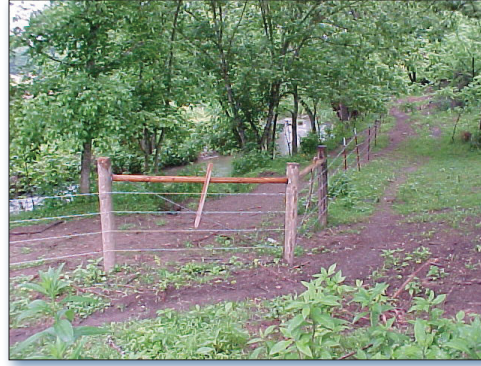
Figure 3. A landowner installed fencing to prevent livestock from accessing the stream and surrounding riparian areas.