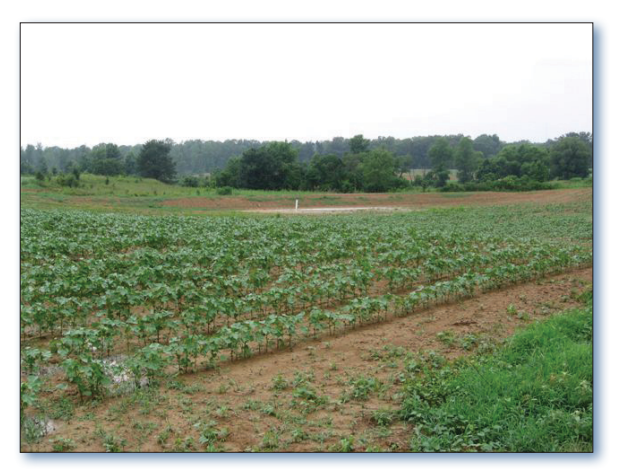
Figure 2. During a rainstorm, runoff drains across this field and collects in the water and sediment control basin seen in the background (Gibson County, Tennessee).