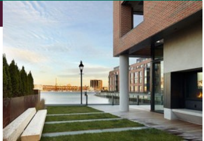
Rear of Union Wharf in the evening

On the 3.5 acre site rests the five-story building, wrapped around a 500-unit parking garage and several courtyards built along the promenade, with 4,500 square feet of it dedicated to retail. The 281 apartment complex is mixed-use residential and development with restaurants. On the lower level, MedStar Medical Group, a pharmacy, and retail outlets occupy the space.