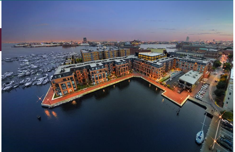
Aerial shot of Union Wharf at Fells Point

First built in 1795, the Union Wharf assumed present form in 1847 as a shoe imports warehouse. By 1900, the Metropolitan Steamship Company operated the site as a Boston-to-Maine steamer terminal. The J.L. Kelso Company stored goods at the site from 1945 to 1977, when Union Wharf Development Associates purchased it for renovation into 281 residential apartments.