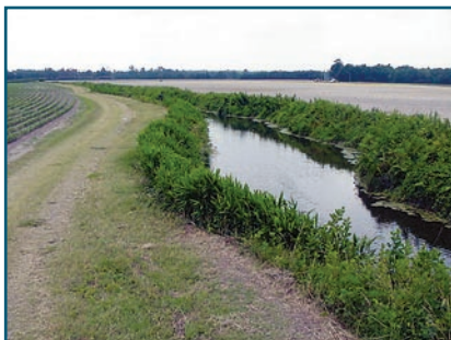
Filter strips in the Neuse River Basin decrease nitrogen loads to the river.

point and nonpoint source pollution in the basin. The plan, backed by figures in the Neuse River TMDL, called for a mandatory 30 percent reduction in nitrogen from point, urban, and rural sources by 2003. The EMC worked with the appropriate nonpoint source agencies to target the implementation of BMPs to reduce