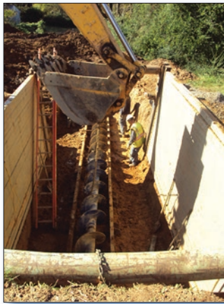
Figure 2. Partners installed sanitary sewer line to replace failing onsite systems.

Using the Crowders Creek Watershed Plan and existing TMDL for FC, the city of Gastonia, in partnership with the Gaston County Natural Resources Department and the Gaston Soil and Water Conservation District (SWCD), planned a complete overhaul of the existing sewer system. Gastonia and Gaston County installed a wastewater collection system connecting homes to