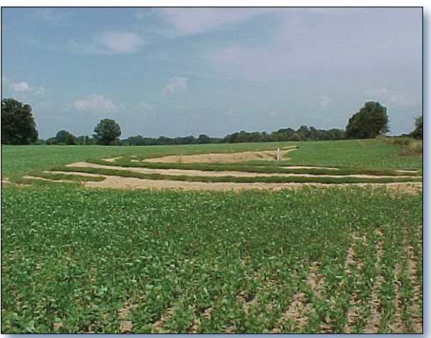
Figures 2 and 3. Examples of water and sediment control basins implemented in western Tennessee.

are the total macroinvertebrate families (or genera); the number of families (or genera) of mayflies, stoneflies, and caddisflies (collectively referred to as EPT—short for the order names Ephemeroptera, Plecoptera and Trichoptera); and the number of pollution-intolerant families (or genera) found in a stream. The biorecon index is scored on a scale from 1 to 15. A score of less than 5 is regarded as very poor. A score of more than 10 is considered good. The 2005 biorecon survey score for DeMoss Creek was 11. The survey documented four EPT families, one intolerant family and 18 total families—yielding an overall habitat score of 93. Those results indicate that the water quality in DeMoss Creek has improved and now supports the creek's fish and aquatic life designated use. Therefore, TDEC removed a 24.2-mile segment of DeMoss Creek from the state's CWA section 303(d) list of impaired waters in 2008.