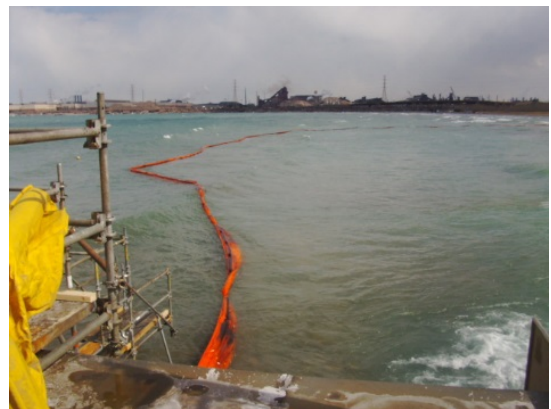
EPA and Coast Guard personnel making up a Shoreline Cleanup Assessment Team overseeing cleanup operations following an oil spill into Lake Michigan.

A memorandum of understanding 2 between the Coast Guard and EPA contained stringent requirements for documentation supporting bills. These requirements included obtaining individual site-supporting documents from the regions