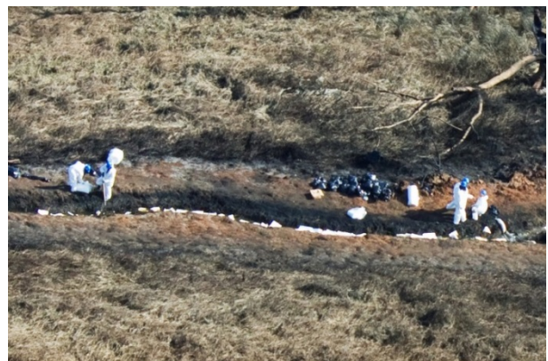
EPA workers after a refinery explosion in Puerto Rico, a FEMA and EPA joint effort.

FEMA deobligated funds from mission assignments before the EPA could bill for reimbursable expenses incurred on mission assignments. As a result, FEMA would no longer have the funding available to reimburse the EPA, and the unbilled receivables balance continued to increase. Based on negotiations with the EPA, FEMA implemented a new policy that requires FEMA to confirm with the EPA that funds are no longer needed before deobligating mission-assignment funds after the project period ended. FEMA now submits quarterly unliquidated obligation reports to the EPA showing outstanding unliquidated obligations in their records. The EPA compares the unliquidated obligation amount on the FEMA