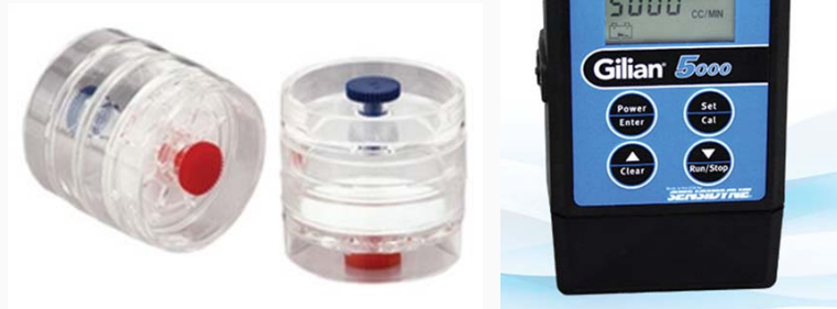
Filter cassette (left) and Gilian pump (right)