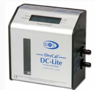
Flow rate calibration unit