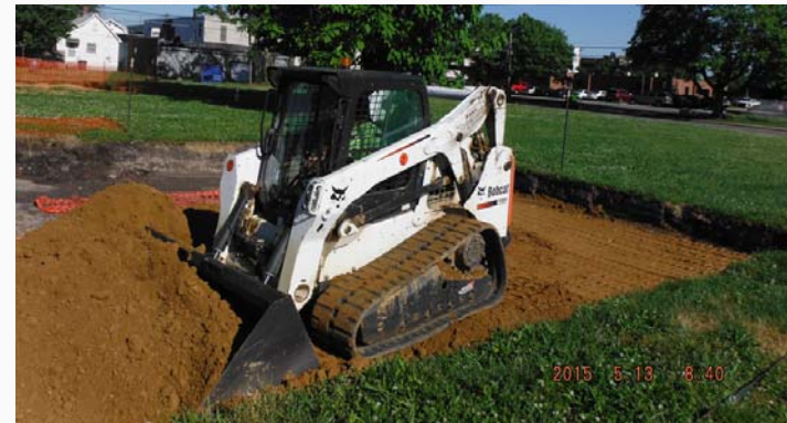
Skid-steer (Backfill placement)