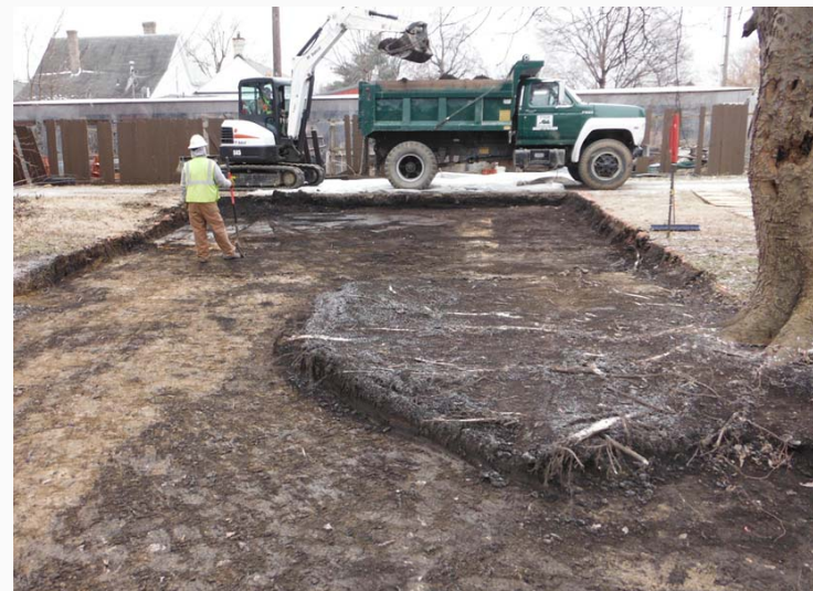
Surficial soil removed under tree canopy