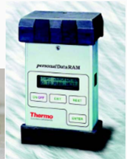
Particulate monitors pDR-1500 (left) and personal sized pDR-1000 (right)