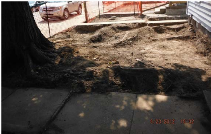
Large tree with roots close to surface