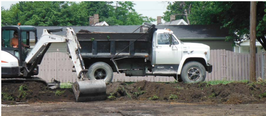
Mini-excavator and dump truck (Excavation)