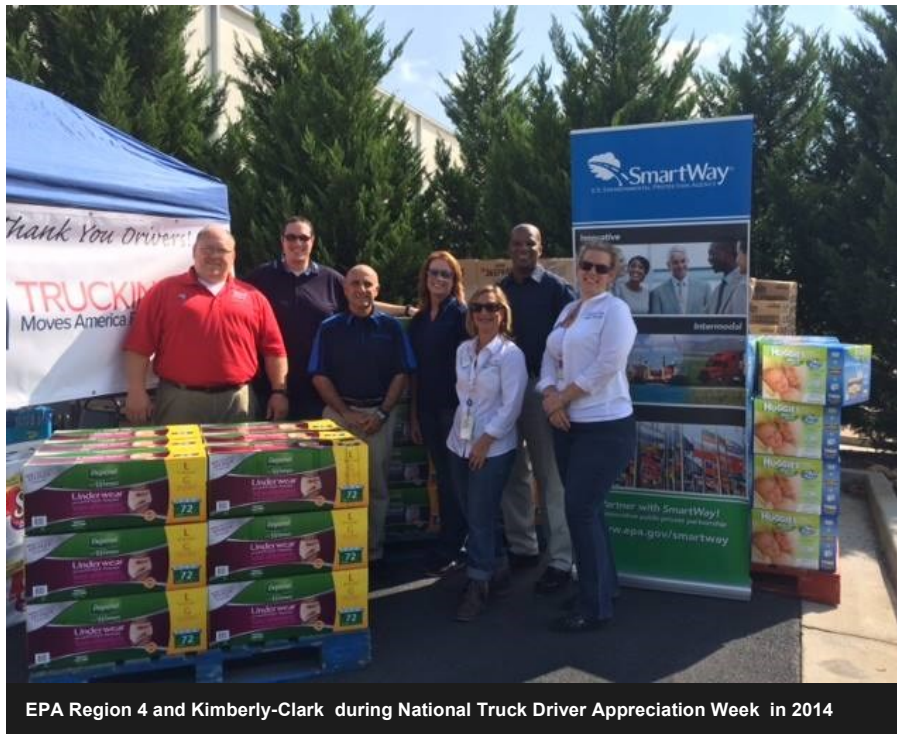
EPA Region 4 and Kimberly-Clark during National Truck Driver Appreciation Week in 2014