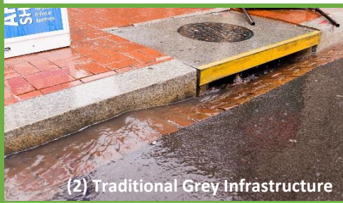
(2) Traditional Grey Infrastructure

The Storm Water Management Model (SWMM) is a simulation model used for single event or long-term simulation of water runoff quantity and quality in primarily urban areas. It includes the application of green infrastructure practices that promote the natural movement of water within an ecosystem, instead of allowing it to run across paved surfaces and down storm drains. Green infrastructure, such as the bioretention cell shown in the image (1) above, allows runoff to infiltrate into the ground instead of allowing it to wash away into drains, as shown in the traditional grey infrastructure image (2) above.