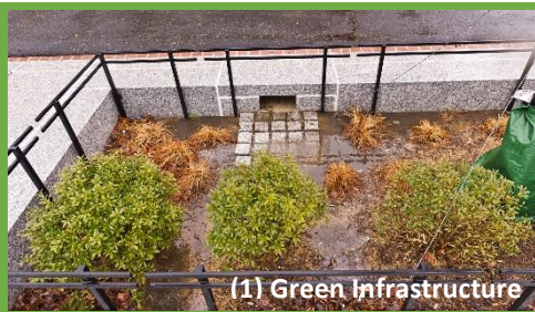
(1) Green Infrastructure