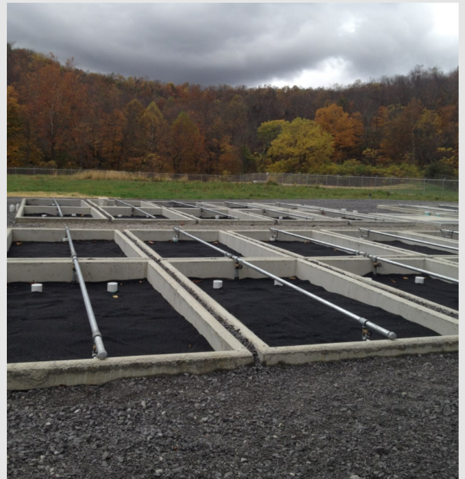
Gravel beds for the filtration of wastewater effluent

For years, septic tanks in Crown, West Virginia were in desperate need of repair. The community's remote location and rugged terrain made it cost prohibitive for to be serviced by centralized treatment, necessitating an onsite wastewater treatment solution. Due to economic hardship the community was not in a position to pay for critical infrastructure upgrades, but they found relief through the CWSRF. Thanks to a $1.57 million grant from the West Virginia Department of Environmental Protection, along with additional funding from the Monongalia County Commission, Crown was able to address public health concerns by installing innovative onsite wastewater collection and treatment systems. The system collects waste in septic tanks and pumps separated effluent through a network of pipes to 44 recirculating sand beds. There, the effluent is filtered into the ground, instead of being discharged to nearby water bodies.