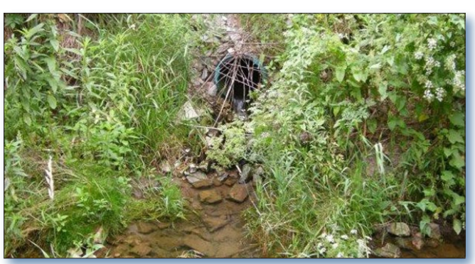
Figure 2. Subsurface drainage tile in Wilson Rhodes Ditch, part of Flowers Creek watershed.

plan for the Middle Eel River and its tributaries, promoting and implementing a cost-share program for BMPs, and conducting water quality monitoring and public outreach. The university hired a watershed coordinator and formed a steering committee to lead development of the watershed management plan. Implementation efforts began after the watershed management plan was completed in early 2011.