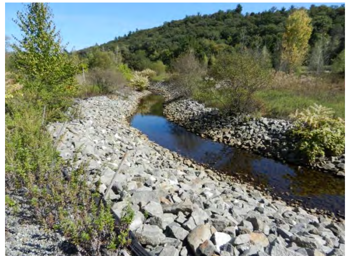
Acid Brook as it enters the DuPont property on the north side

An area of concern (AOC) is a location that may have experienced environmental degradation and has been determined to warrant further investigation or remediation by the environmental regulatory agency (i.e. NJDEP or EPA). The identification of AOCs depends on many factors and differs from site to site. So far, 202 AOCs have been identified and more than 30 have been addressed.