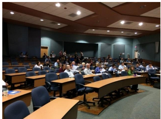
Participants from the US, Canada and Mexico gather at the Tech H2o in El Paso, Texas to discuss an International Integrated Heat Health Information System.

The morning session presentations provided the audience with a glimpse at how different agencies monitor weather, deal with heat related emergencies, agencies which offer help to those who are in need of relief from extreme heat, and other city-wide solutions in areas prone to high heat indexes. One talk focused on the current pilot programs that are implemented in Arizona, such as, a “cold-button” located at bus stops, in which, a button when pressed will release a fast cold gust of air from above to try to cool of pedestrians as they wait for their bus. Other talks focused on how their agency provides resources for people from lower socio-economic programs, for instance, delivering cooling fans to those who cannot afford one.