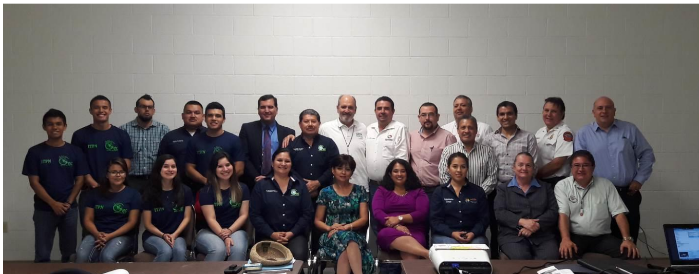
Meeting Participants in Amistad Task Force on June 21, 2016 in Del Rio, Texas.

Finally, the meeting included a session on projects funded under the 2015-2016 Border RFP, as well as, a group discussion on the close-out of 2015-2016 Border 2020 Two-Year Action Plan. More information: Carlos Rincon ( Rincon.carlos@epa.gov )