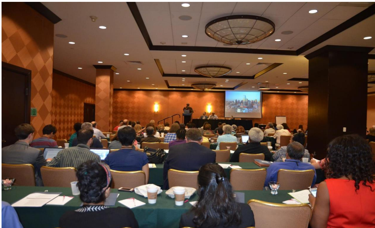
2016 EJ Summit Participants in Dallas, Texas