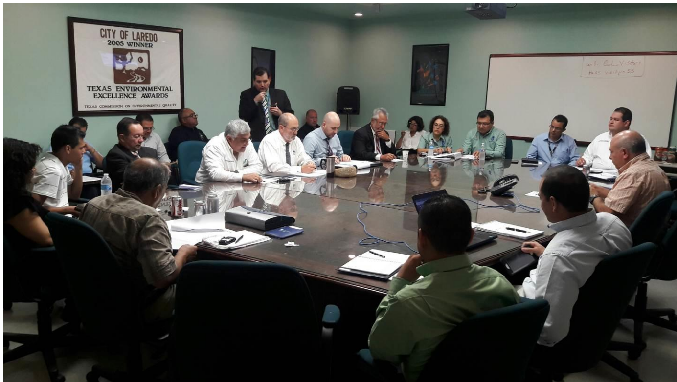
Meeting Participants in Falco Task Force (Environmental Health & Education Subcommittee) met on June 22, 2016 at the Laredo Environmental Services Department meeting space.