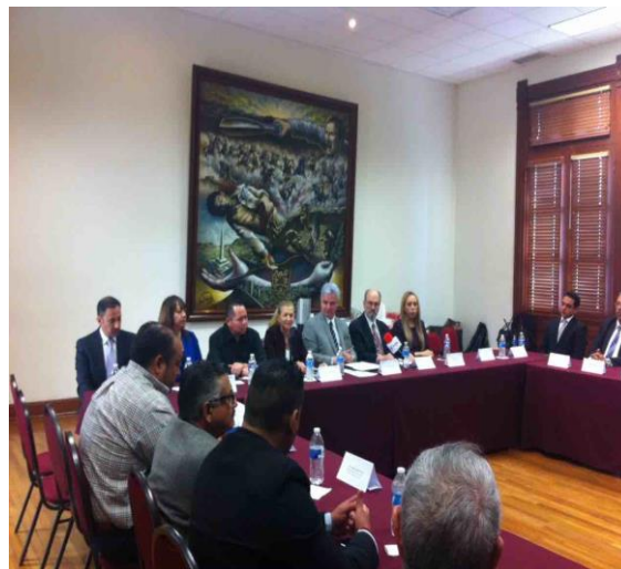
On September 6, the ProAire was presented to the Governor of Chihuahua at the State Building in the city of Chihuahua.

Similar to the SIP process in the US, the two agencies, SEMARNAT and SEDUE, along with members of the JAC, dedicated resources towards conducting 11 public meetings to include stakeholder input, that included the general public, stakeholders from various sectors such as local and federal governments, academia, public health non-governmental organizations, industry, chamber of commerce, transportation, and international trade and custom brokers. The State of Chihuahua ProAire program, will serve as a template for the other 5 Northern (Border) Mexican States on how to engage and leverage various resources and collaborations, that include, possible contributions from their U.S. corresponding partners. More information: Carlos Rincon ( Rincon.carlos@epa.gov )