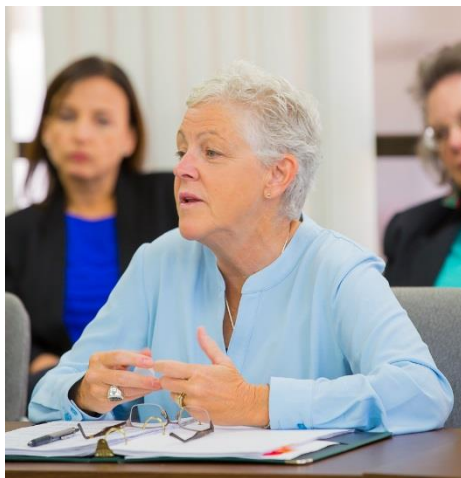
EPA Administrator Gina McCarthy addresses pediatricians and medical students in El Paso, Texas.

In July 2016, EPA Administrator Gina McCarthy visited the border to learn more about the environmental health issues that residents who live in border colonias and rural communities in West Texas and Southern New Mexico still face. Through her meetings with local stakeholders she also conveyed EPA’s role in public health. During her visit to El Paso, Texas, Administrator McCarthy was able to meet with pediatricians from the Southwest Center for Pediatric Environmental Health (SWCPEH), staff at the West Texas Regional Poison Center, and students enrolled in public health at the University of Texas Houston School of Public Health and Texas Tech University, as well as, University of Texas at El Paso – EPA summer interns. During the meeting, attendees discussed regional concerns, like poor air quality and its effect on respiratory health, and how food swamps — areas inundated with junk food — propagate diabetes and obesity. “A lot of people don’t know it, but the EPA is fundamental for public health,” McCarthy said. “It’s about bringing safe drinking water; it’s about clean air; it’s about what products you use and what kind of exposures to toxic chemicals you may face.”