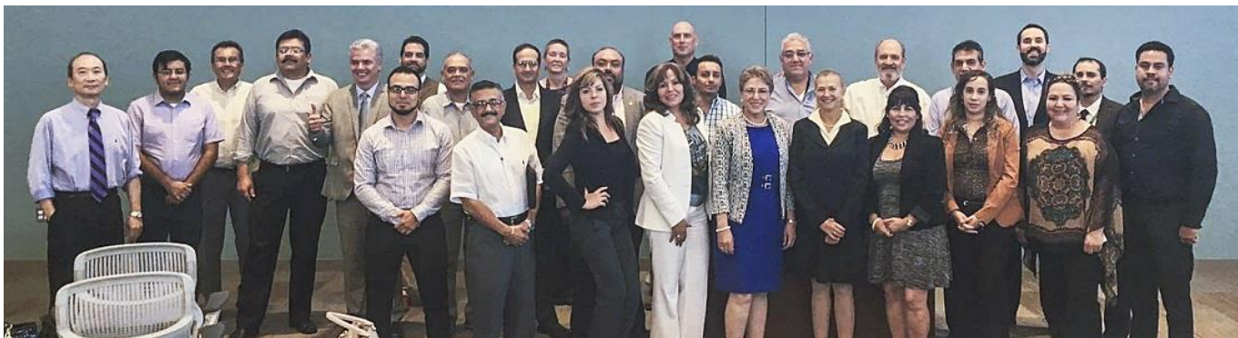
Attendees at the 67 th meeting of the Joint Advisory Committee (JAC) in El Paso, Texas on September 22, 2016.

Over the past year the Ecology Department of Ciudad Juárez, the SEMARNAT, the TCEQ, the EPA, and many others have collaborated on enhancing air quality monitoring in the binational airshed. The group held a half dozen binational planning calls with simultaneous interpretation and up to 20 participants from both sides of the border. In August management and technical staff from Ciudad Juárez visited TCEQ headquarters in Austin, and later that month, an air quality subcontractor performed an extensive on-site audit of the three continuous air monitors in Ciudad Juárez.