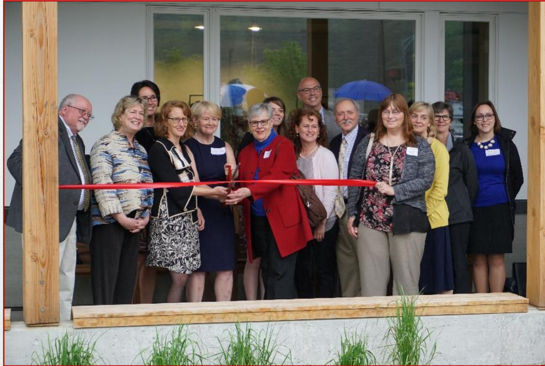
Red Clover Commons Senior Housing Ribbon Cutting | Brattleboro, Vermont