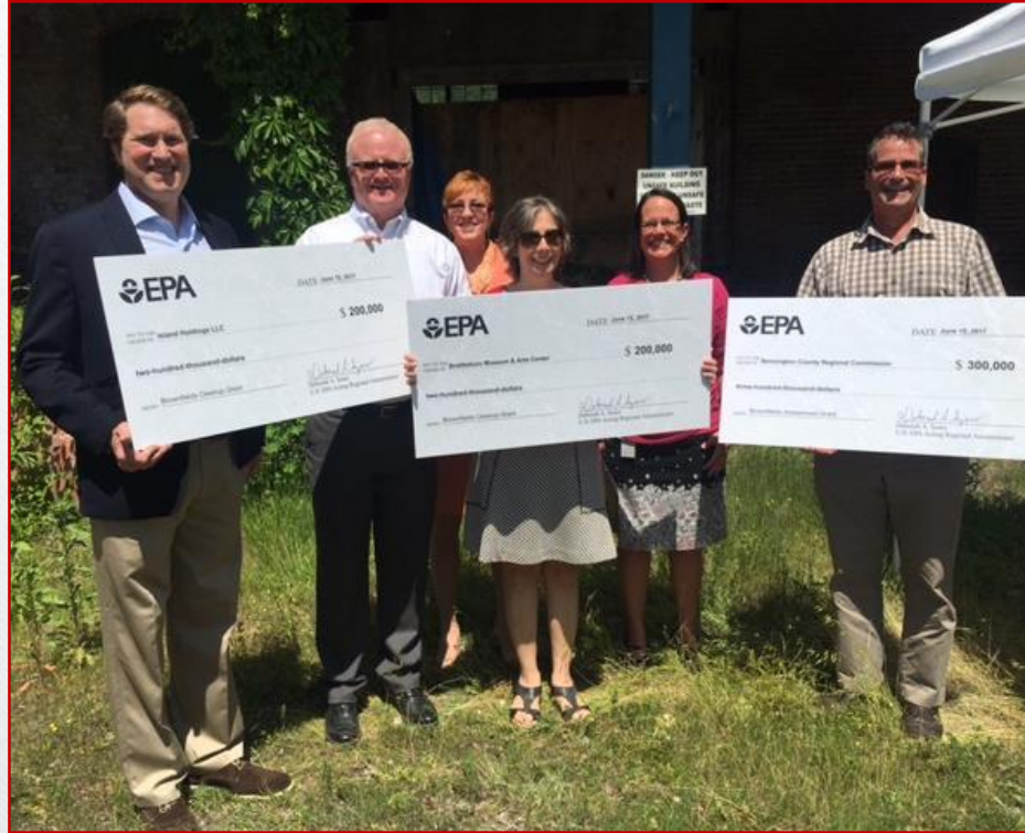
Grant Announcement Event | Bellows Falls, Vermont