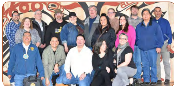
Region 10 RTOC Members