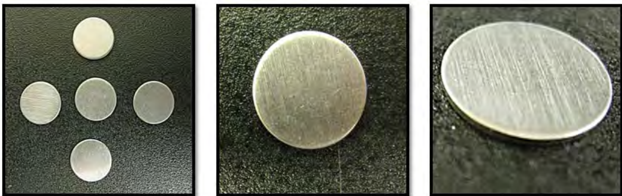
Fig. 1: Examples of typical acceptable 430 SS carriers.