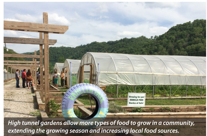
High tunnel gardens allow more types of food to grow in a community, extending the growing season and increasing local food sources.