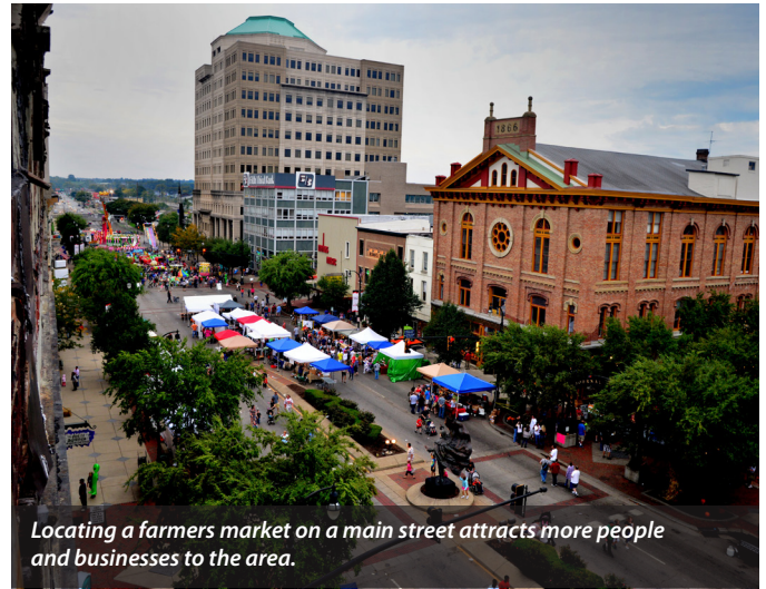
Locating a farmers market on a main street attracts more people and businesses to the area.

The city of McCrary, Arkansas , plans to comprehensively address barriers to good nutrition and physical activity by strategically connecting and integrating multiple efforts, including a new community/school garden; a new “healthy hub” that brings clinical screening services, nutrition education classes, cooking demonstrations, prescription assistance, and food pantry distribution under one roof; and a potential farmers market and culinary incubator.