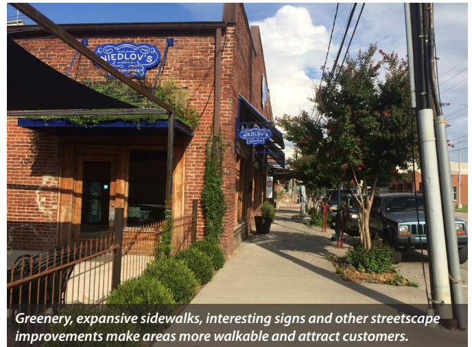
Greenery, expansive sidewalks, interesting signs and other streetscape improvements make areas more walkable and attract customers.

The Jefferson County Soil and Water Conservation District is seeking assistance to help coordinate multiple revitalization and food security initiatives in a densely populated, demographically diverse area of downtown Louisville, Kentucky , that suffers from high poverty and unemployment, a growing urban heat island effect, the recent closure of its retail grocery stores, and a significant number of abandoned and vacant properties. Planning for a new cooperative grocery store will incorporate strategies to improve air, water, and soil quality while increasing tree cover and access to public green spaces.