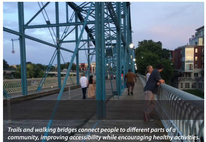
Trails and walking bridges connect people to different parts of a community, improving accessibility while encouraging healthy activities.

Engine, a nonprofit organization in Biddeford, Maine , will plan for the redevelopment of a vacant main street building, made possible through a brownfields cleanup grant, to support continued revitalization of the historic Main Street and Mill District. The project will house food-related businesses and nonprofits and include an 8,000-square-foot green space and urban garden on the rooftop.