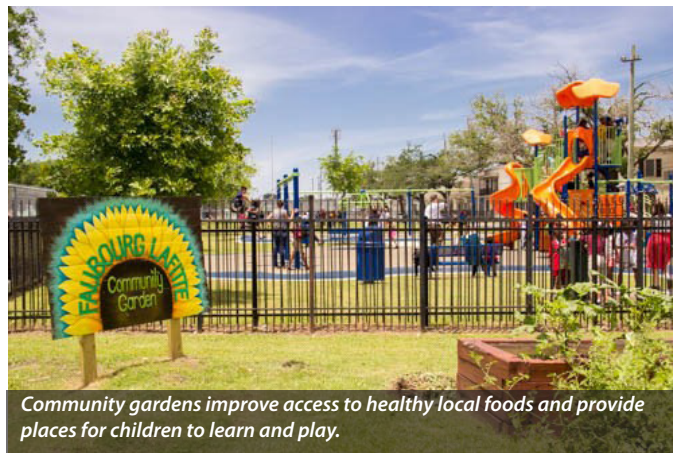
Community gardens improve access to healthy local foods and provide places for children to learn and play.

In support of its goal to become a more healthy, walkable, and bikeable community, the Hopewell Downtown Partnership in Hopewell, Virginia , will explore creating a new kitchen incubator in a downtown building that could help develop new food entrepreneurs and catalyze new businesses to locate in vacant storefronts. A possible community garden on an adjacent lot will help educate residents and contribute to the area's revitalization.