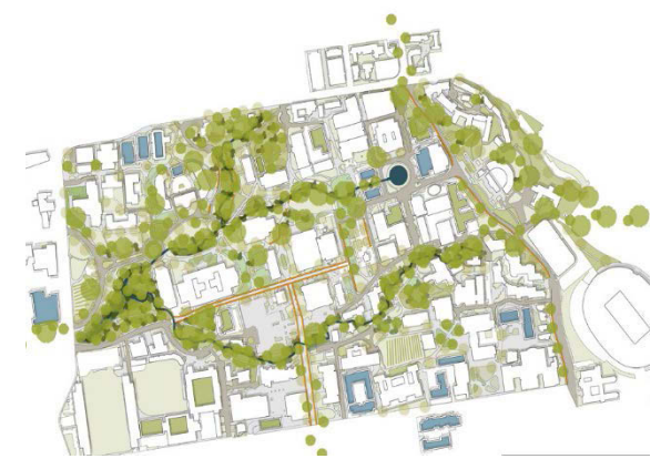
Source: University of California, Berkeley's first place entry in the 2017 Campus RainWorks Challenge.