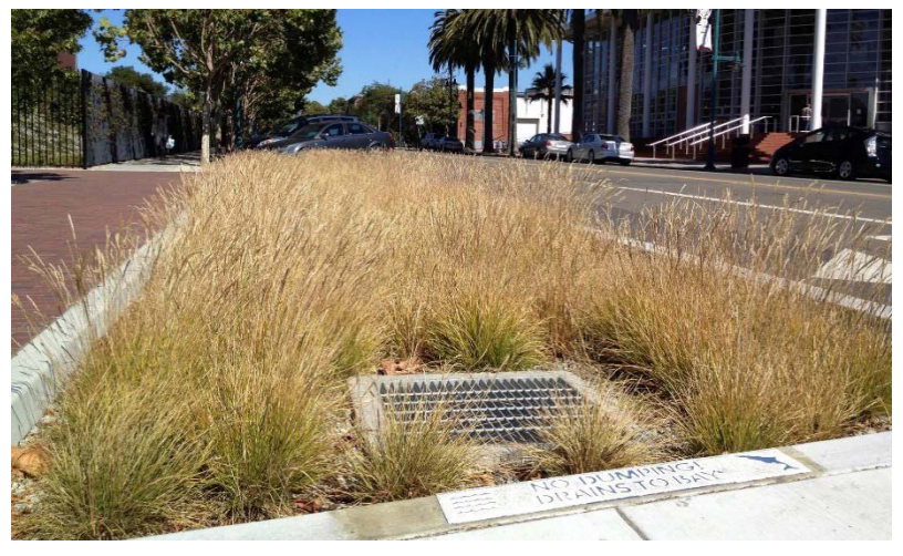
A vegetated basin allows stormwater to infiltrate and evapotranspire, preventing contaminated runoff from reaching local water bodies.

air quality, reducing urban heat island effects, creating habitat for pollinators and other wildlife, and providing aesthetic and recreational value. Green infrastructure solutions can also be cheaper to install and maintain than traditional gray infrastructure.