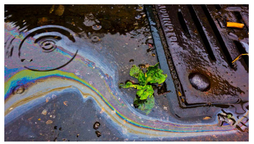
Runoff contaminated with oil and other debris is washed down a storm drain where it will be conveyed to local water bodies.

The term "green infrastructure" refers to a variety of practices that restore or mimic natural hydrological processes. While "gray" stormwater infrastructure is largely designed to convey stormwater away from the built environment, green infrastructure uses soils, vegetation and other media to manage rainwater where it falls through capture and evapotranspiration. By integrating natural processes into the built environment, infrastructure green provides a wide variety of community benefits, including improving water and