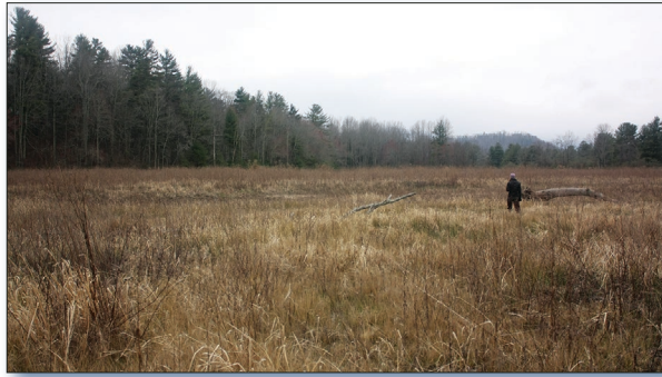
Figure 2. This restored portion of Ochlawaha Bog had been a farm field.

subwatershed, a tributary of Clear Creek. These facilities were installed to prevent potential spills during mixing and filling of sprayers (a source identified in the Mud Creek Watershed Plan .) The new facilities will capture spills and prevent pollutants from flowing into adjacent surface waters or seeping into groundwater of Mud Creek’s headwaters. Other restoration efforts included stabilizing 930 linear feet of eroding dirt road bed, which prevented an estimated 25 tons of sediment from entering Cox Creek, another headwaters tributary. Finally, project partners stabilized 1,275 linear feet of eroding stream bank and planted native riparian vegetation, preventing 17 tons of future annual soil loss. Post-implementation monitoring showed that Bank Erosion Hazard Index (BEHI) scores improved slightly and pebble counts indicated improvement in the quality of substrate.