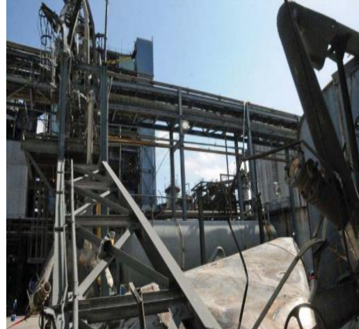
Explosion damage at the Packaging Corporation of America facility in DeRidder, Louisiana. The bottom-right corner of the photograph shows the upside-down foul condensate tank base. The explosion separated the tank from its base.

3. Chemical Fire and Facility Flooding from Hurricane Harvey in Crosby, Texas. The CSB found that three refrigerated trailers containing organic peroxides, which are unstable at some temperatures, burned in two separate fires when the trailers lost refrigeration and caused evacuations within a 1.5-mile radius ( report issued May 24, 2018).