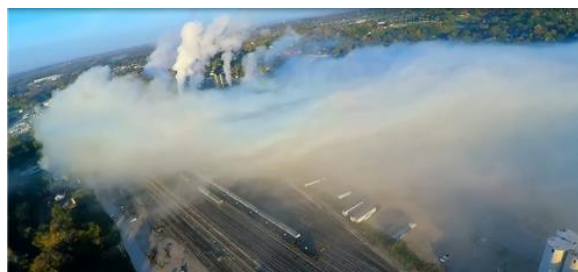
Chemical release plume at plant in Atchison, Kansas.