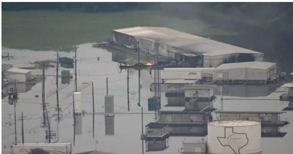
First refrigerated trailer to burn (shown smoldering) at the Arkema Crosby, Texas, chemical facility after flooding from Hurricane Harvey in August 2017.