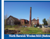
North Berwick Woolen Mill (Before)

The U.S. Environmental Protection Agency's (EPA) Brownfields Program provides funds to empower states, communities, and other stakeholders to work together to prevent, assess, safely clean up, and sustainably reuse brownfields. EPA provides technical and financial assistance for brownfields activities through an approach based on four main goals: protecting human health and the environment, sustaining reuse, promoting partnerships, and strengthening the marketplace. Brownfields grants serve as the foundation of the Brownfields Program and support revitalization efforts by funding environmental assessment, cleanup, and environmental workforce and job training activities. Thousands of properties have been assessed and cleaned up through the Brownfields Program, clearing the way for their reuse.