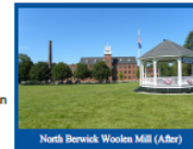
North Berwick Woolen Mill (After)

The U.S. Environmental Protection Agency's (EPA) Brownfields Program provides funds to empower states, communities, and other stakeholders to work together to prevent, assess, safely clean up, and sustainably reuse brownfields. EPA provides technical and financial assistance for brownfields activities through an approach based on four main goals: protecting human health and the environment, sustaining reuse, promoting partnerships, and strengthening the marketplace. Brownfields grants serve as the foundation of the Brownfields Program and support revitalization efforts by funding environmental assessment, cleanup, and environmental workforce and job training activities. Thousands of properties have been assessed and cleaned up through the Brownfields Program, clearing the way for their reuse.