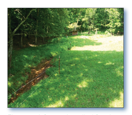
Figure 2. A farmer installed fencing to prevent livestock from accessing this Stock Creek tributary.

Funding sources for Stock Creek watershed improvements included the CWA section 319 program, the state's Agricultural Resources Conservation Fund (created through Tennessee's real estate transfer tax). NRCS Farm Bill funding programs and matching funds from landowners. A CWA section 319 grant of