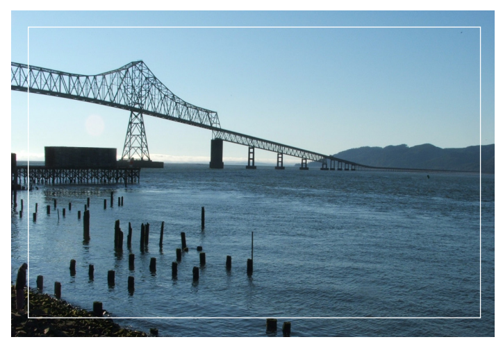
THE ASTORIA-MEGLER BRIDGE NEAR THE MOUTH OF THE COLUMBIA RIVER.

The City of Vancouver Public Works Department will lead a study to conduct water quality sampling at six locations within the Columbia Slope sub-watershed. The sampling will expand the city's