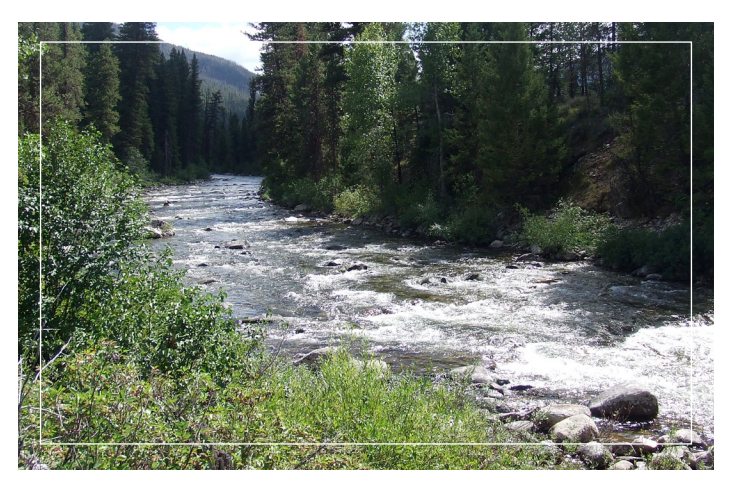
JOHNSON CREEK IN VALLEY COUNTY, IDAHO, A TRIBUTARY OF THE SALMON RIVER.