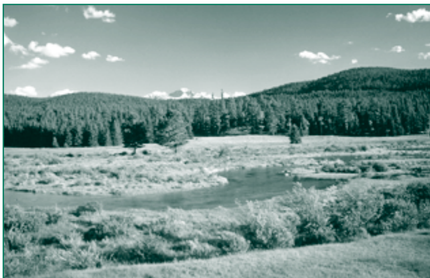
Wetlands are among the most biologically diverse ecosystems in the world.