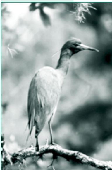
Monitoring wetlands helps to ensure quality habitat for wildlife like this little blue heron that depend on wetlands to survive.

CWA Section 303(d) requires states and tribes to identify impaired waters and develop total maximum daily loads (TMDLs) for those waters. Wetland monitoring can provide information on whether wetlands need to be added to or removed from the list of impaired waters. In addition, wetland monitoring can support the development of TMDL implementation plans, which should always include