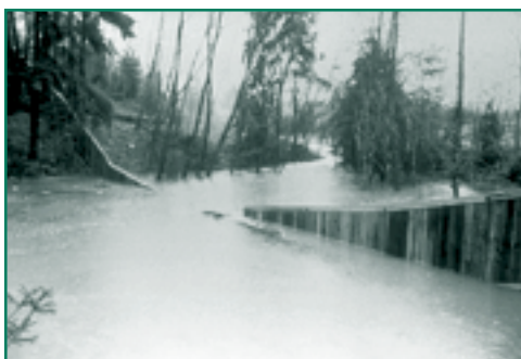
Because of their strategic position in the landscape, wetlands help attenuate flooding.