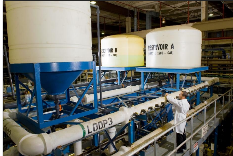
ORD Laboratory Capabilities