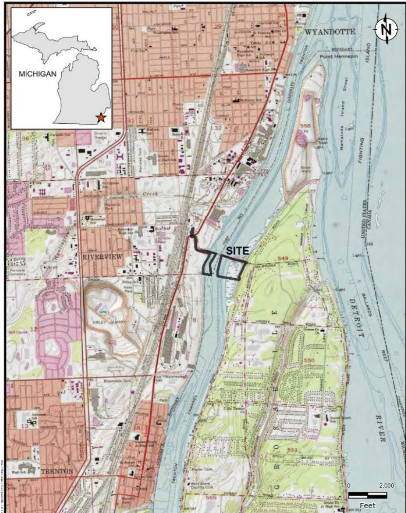
Figure 1. Location of the MCUTC Study Area

Compared to the western shore of Trenton Channel, the eastern shore is less industrialized. The eastern shore is part of Hennepin Marsh and consists of shallow coastal wetlands, emergent shoreline, and three small barrier islands. Erosion of the islands is evident from historical aerial