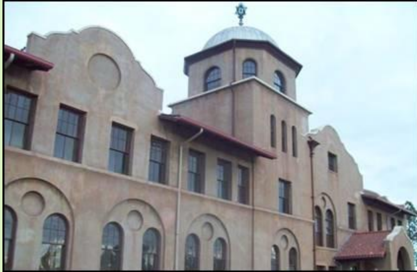
Figure 2: Minnequa Steelworks Administration Building - $200k Cleanup Grant for asbestos abatement and lead based paint encapsulation