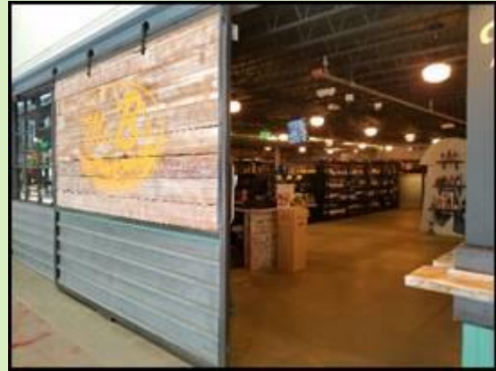
Figure 4: Inside Stanley Marketplace