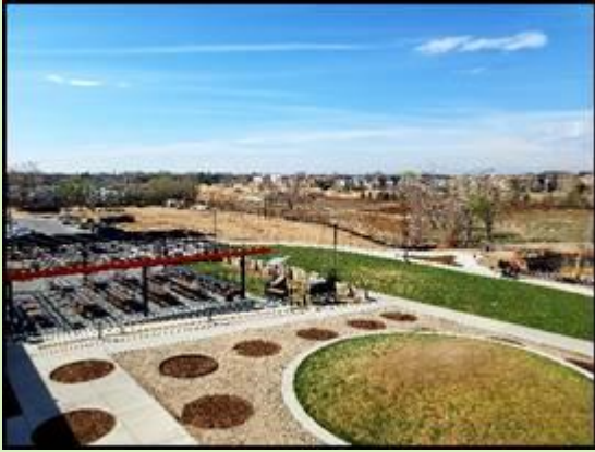
Figure 3: Outside Stanley Marketplace